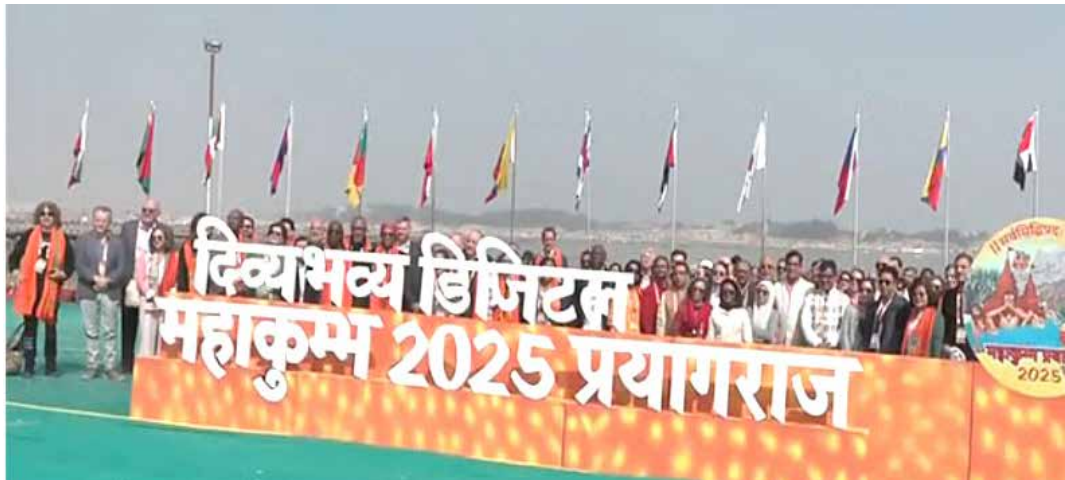
118-Member delegation from 77 countries arrives in Prayagraj