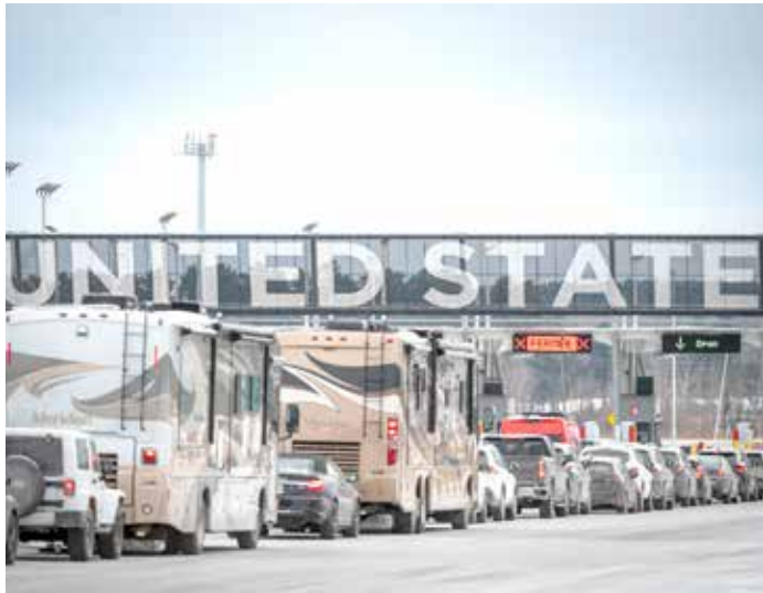
Cars wait in line to enter the United States at a border crossing at the Canada-US border in Blackpool, Quebec, Canada

Beijing said the measures were in response to the "unilateral tariff hike" by Washington.