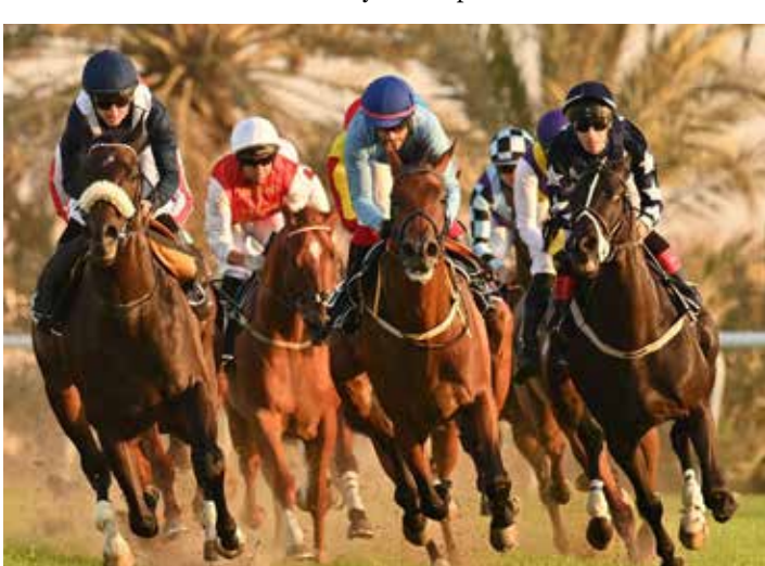
Action from yesterday's card