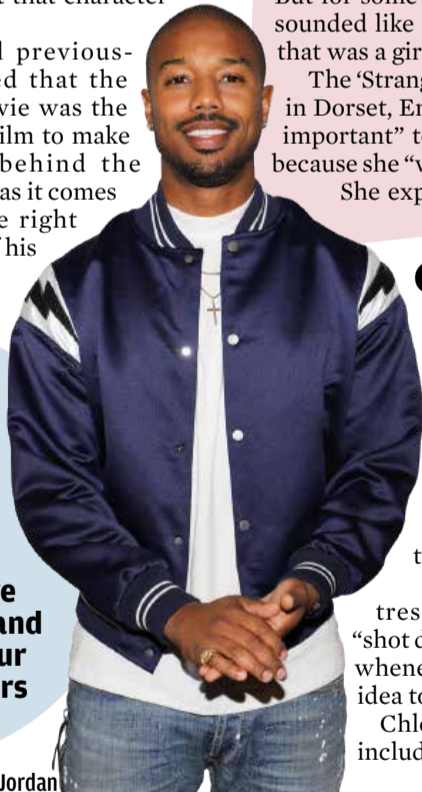
Michael B. Jordan

Michael previously revealed that the sports movie was the “perfect” film to make his bow behind the camera on as it comes during the right moment of his career.