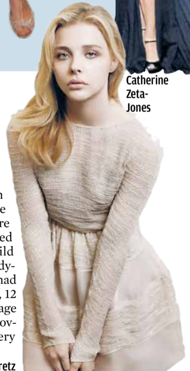
Chloe Grace Moretz