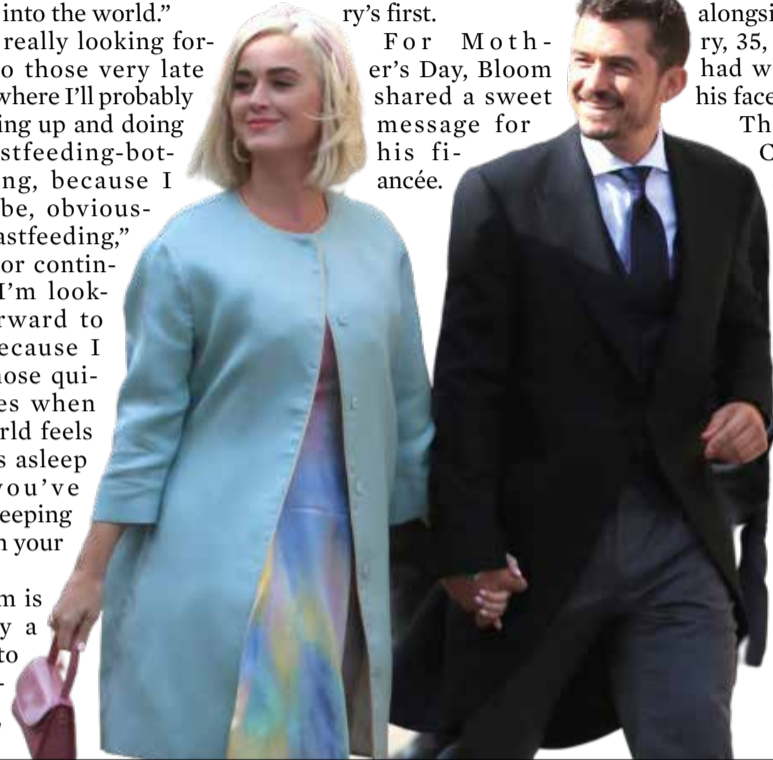
Orlando Bloom and Katy Perry

“You’ve taught me wisdom, kindness & compassion and what it means to be someone people can depend on. Lessons I will continue to do my best to share with my boy and the lil girl to come,” Bloom wrote.