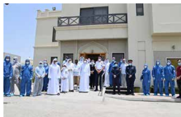
Northern Governor, Ali bin Al-Shaikh Abdulhussain Al-Asfoor, launching disinfection campaigns part of the national efforts to combat the novel coronavirus (COVID-19). The campaigns aim to raise awareness on the importance of continuing the sanitisation process, as the best means to reduce the spread of the pandemic. The campaign was launched in cooperation with the General Directorate of Civil Defence and the Northern Governorate Police Directorate, and the participation of MPs, municipal council members and NGOs.