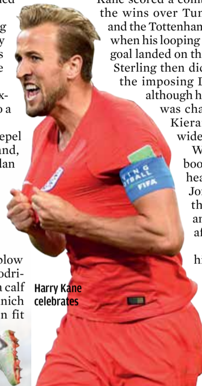
Harry Kane celebrates

Pickford made his first save from a fizzing long-range effort from Juan Fernando Quintero, while Jesse Lingard sliced over after Colombia half-cleared a cross.