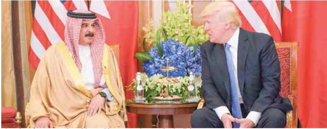
His Majesty in conversation with Donald Trump as they met in Riyadh last year.

The FTA and its companion agreement, the Bilateral Investment Treaty, have supported a growing number of corporate