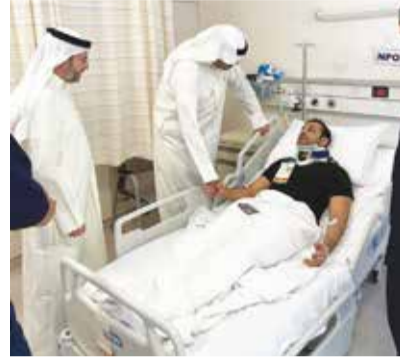
Defense Minister visits people injured in Iranian attack on Kuwait Airport

Seven major emergency operations were performed for those requiring urgent intervention. Hospitals, emergency departments and ambulance services were placed on heightened alert, operating under enhanced