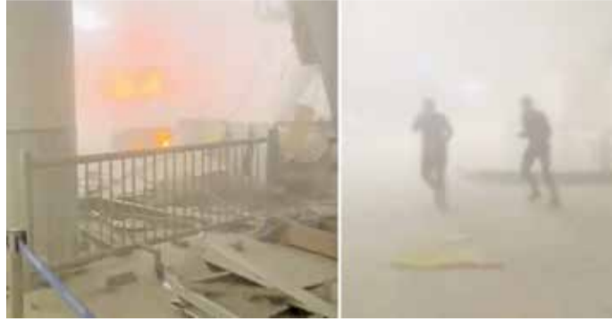
Extensive damage at Kuwait International Airport's T1 building following Iran's missile and drone strike overnight.

The attack claimed one life—an Indian expatriate—and left 63 people injured, seven of them in critical condition requiring major emergency surgery. Kuwait's Ministry of Health activated a comprehensive emergency response from the first hours of the