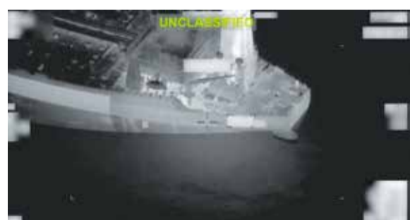
A Botswana-flagged oil tanker was disabled by U.S. forces while attempting to sail towards an Iranian port in the Arabian Gulf.

CENTCOM also said American forces destroyed three one-