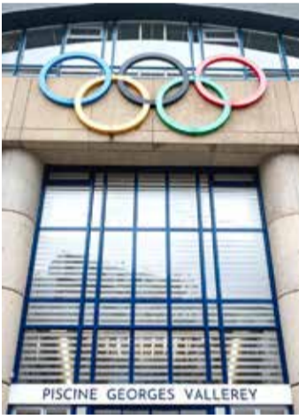
a view of the main entrance of the Georges Vallerey swimming pool, which is under renovation to serve as a training pool for Olympic and Paralympic athletes selected for the Paris 2024 Games, in Paris

"Although such incidents are rare compared to the number of reservations, Airbnb commits, through this long-term collaboration, to supporting efforts made by the industry and the authorities to put an end to exploitation and human trafficking," the platform said in a