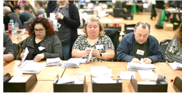
Poll workers work through the night counting ballots

Britain's Labour yesterday urged Prime Minister Rishi Sunak to call a general election after the opposition party made significant gains in English polls that included a seat in parliament. Labour leader Keir Starmer said the party's parliament seat win in Blackpool South in northwest England sent a clear message to Sunak, who has until late January next year to call and then hold a nationwide vote. "Blackpool speaks for the whole country in saying, 'We