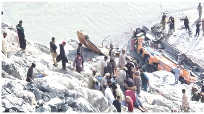
Rescuers respond after the bus accident

At least 20 people were killed yesterday when a bus plunged into a deep valley in Pakistan's mountainous northern region, police said. The driver lost control of the vehicle on a bend near the city of Chilas, in the Gilgit-Baltistan region, around dawn, falling into a rocky ravine where the River Indus flows. "The local Ulema (Muslim leader) announced the news of the accident from the loudspeaker of the mosque and urged the people to donate blood for the injured," Azmat Shah, a police official in the city told AFP. Road accidents with high fatalities are common in Pakistan, where safety measures are lax, driver training is poor and transport infrastructure often decrepit.