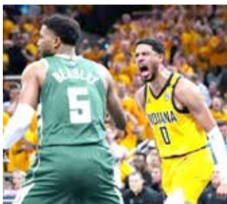
Tyrese Haliburton of the Indiana Pacers reacts after a dunk while Milwaukee's Malik Beasley looks on

Sixers star Joel Embiid cut the deficit to one with a driving layup seconds later but then fouled out and the Knicks polished it off with free throws