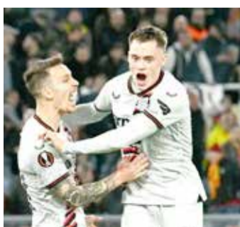
Florian Wirtz (R) celebrates his opener against Roma

Leverkusen will meet either Atalanta or Marseille in Ireland should they hold out in Germa-