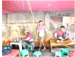
Delivery riders sit and rest at a street restaurant during a heatwave in Yangon