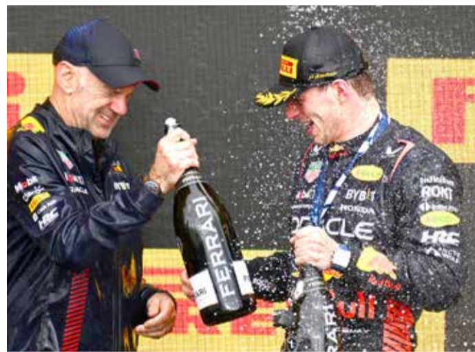
Adrian Newey, the Chief Technical Officer of Red Bull Racing and First placed Max Verstappen of the Netherlands and Oracle Red Bull Racing celebrate on the podium during the 2023 F1 Grand Prix of Canada (file photo)

"I'm not saying that he wasn't doing anything but his role has