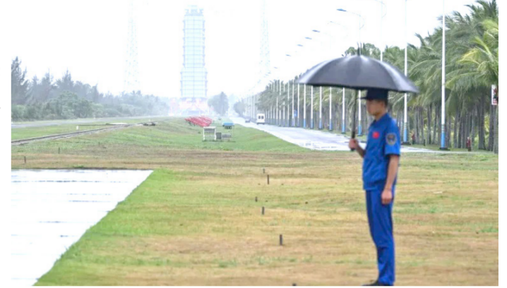
A guard stands watch near the launch platform for the Chang'e-6 lunar mission

China is set yesterday to launch a probe to collect samples from the far side of the Moon, a world first as Beijing pushes ahead with an ambitious programme that aims to send a crewed lunar mission by 2030. A rocket carrying the Chang'e-6 lunar probe is scheduled to blast off from the Wenchang Space Launch Center in southern China's Hainan province just before 5:30 pm (0930 GMT), officials have said. It is the latest leap for China's ambitious space programme, which Washington has warned is being used to mask military objectives and an effort to establish extraterrestrial dominance. The Chang'e-6 aims to collect around two kilograms of lunar samples from the far side of the Moon and bring them back to Earth for analysis. It is a technically complex 53-day mission that will also see it attempt an unprecedented launch from the side of the Moon that always faces away from Earth. "Chang'e-6 will collect samples from the far side of the Moon for the first time," Ge Ping, vice director of China's Lunar Exploration and Space Engineering Center, told journalists. The probe is set to land in