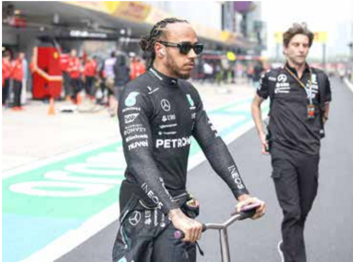
Mercedes' British driver Lewis Hamilton (C) rides a scooter ahead of the Formula One Chinese Grand Prix race

Lewis Hamilton added fuel to the rumours over the future of departing Red Bull designer Adrian Newey saying on Thursday that he would be an "amazing addition" for his future team Ferrari.