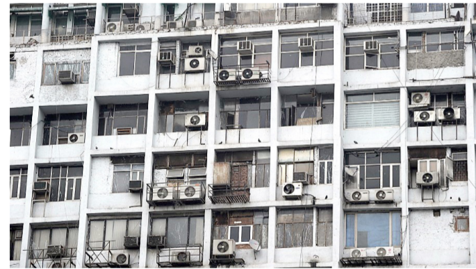
A view shows air conditioning units installed on a building in New Delhi