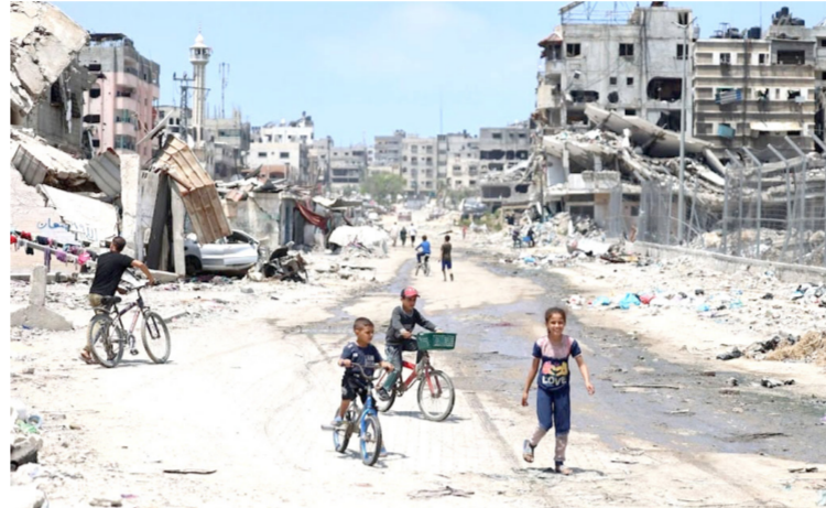
Palestinian children ride their bicycles along a street devastated by Israeli bombardment in Gaza City