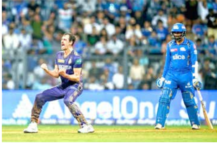
Kolkata Knight Riders' Mitchell Starc (L) celebrates after his team's win against Mumbai Indians

hopes with a 35-ball 56 but his dismissal in the 16th over tilted the scales in favour of Kolkata.