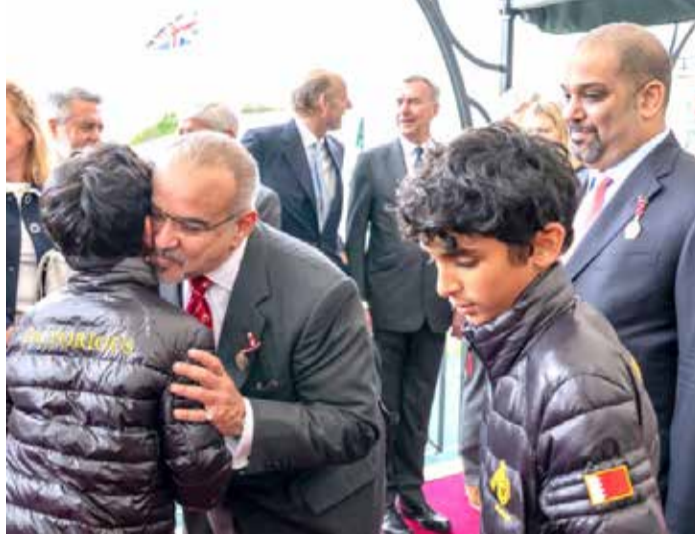
His Royal Highness Prince Salman bin Hamad Al Khalifa, the Crown Prince and Prime Minister, with King Charles III of the United Kingdom of Great Britain and Northern Ireland, Head of the Commonwealth, during the Royal Windsor Horse Show's Endurance race held at the Windsor Great Park. Acknowledging the Royal Windsor Horse Show's significance as a prestigious international equestrian competition, His Royal Highness expressed gratitude to the organisers and wished them continued success. His Royal Highness Prince Salman also viewed various competitions and displays at the Royal Windsor Horse Show and the crowning of winners from different races and competitions, extending best wishes to all competitors.