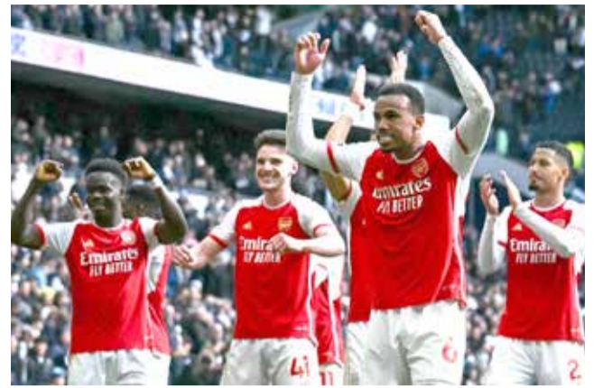
Arsenal's Brazilian defender #06 Gabriel Magalhaes (C) celebrates with teammates at the end of the match against Tottenham Hotspur