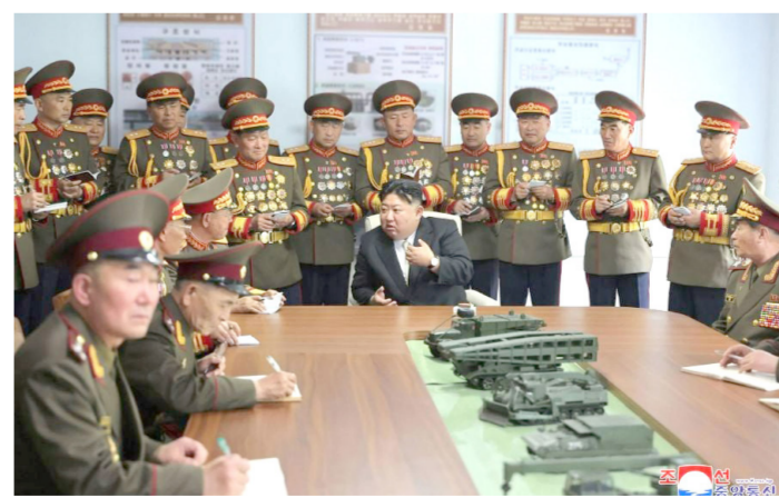
North Korea's leader Kim Jong Un (C) paying a visit to Kim Il Sung Military University in Pyongyang

South Korea's spy agency said yesterday that Pyongyang was plotting "terrorist" attacks targeting Seoul's officials and citizens overseas, with the foreign ministry raising the alert level for diplomatic missions in five countries. The National Intelligence Service said it had recently "detected numerous signs that North Korea is preparing for terrorist attacks against our embassy staff or citizens in various countries, (such as) China, Southeast Asia, and the Middle East". "North Korea has dispatched agents to these countries to expand surveillance of the South Korean embassies and is also engaging in specific activities such as searching for South Korean