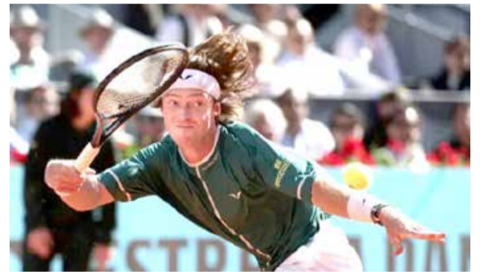
Russia's Andrey Rublev inaction against American Taylor Fritz