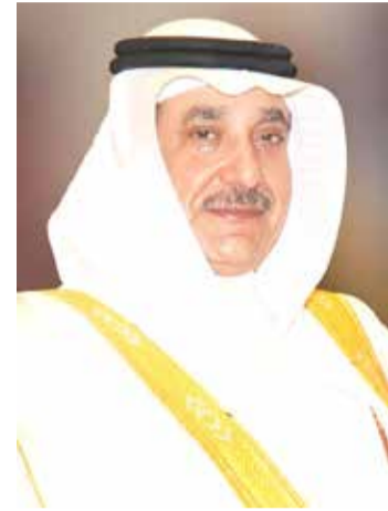
Jameel Humaidan, the Labour Minister

This proactive approach was outlined by the minister as he addressed a parliamentary que-