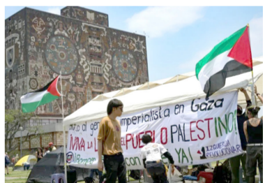
Activists gather in front of the rectory building of the Autonomous University of Mexico