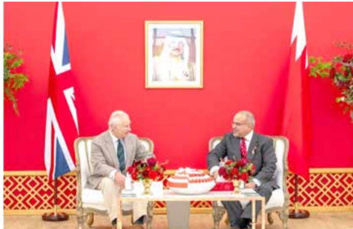
The Crown Prince and Prime Minister during talks with King Charles III, the King of the United Kingdom of Great Britain and Northern Ireland, President of the Commonwealth, during the Royal Windsor International Endurance Championship held in Britain.

His Royal Highness Prince Salman bin Hamad Al Khalifa, the Crown Prince and Prime Minister, yesterday affirmed Bahrain's commitment to multisectoral