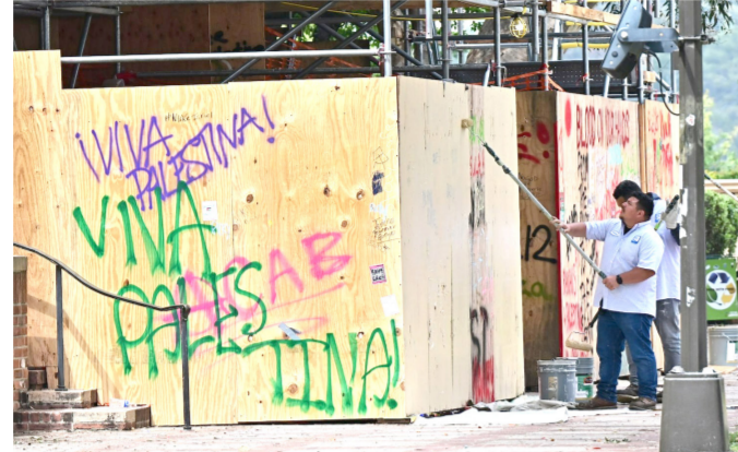
Workers clean up the University of California, Los Angeles (UCLA) campus after police evicted pro-Palestinian students