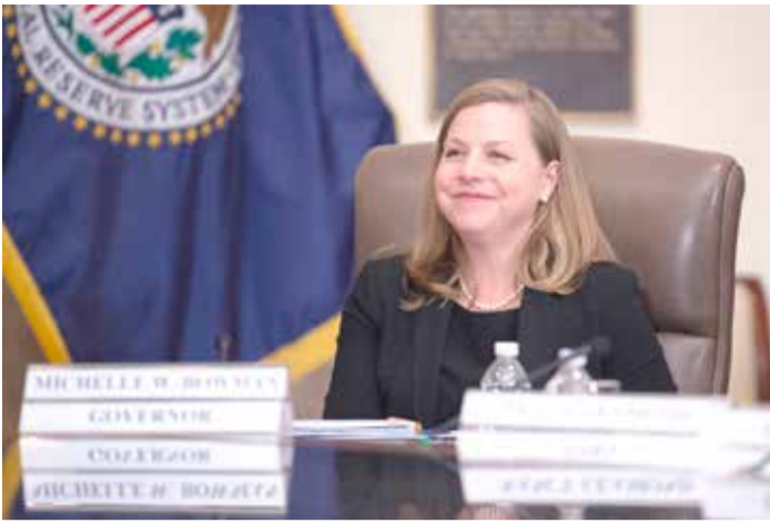
US Federal Reserve Governor Michelle Bowman

The Fed has held interest rates at a 23-year high in recent