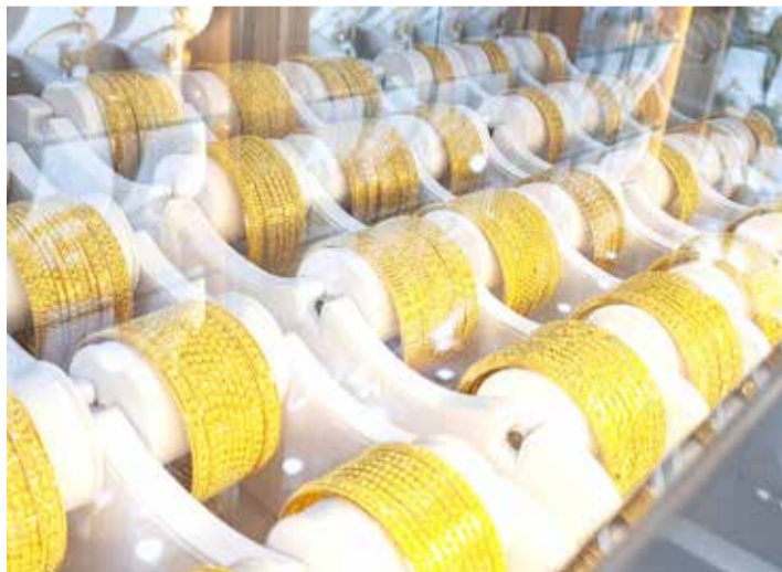
Gold bracelets displayed in a shop window on Green Street, east London

Yet the recent spike in gold prices -- driven by haven demand amid geopolitical tensions, and the prospect of US interest rate cuts which weighs