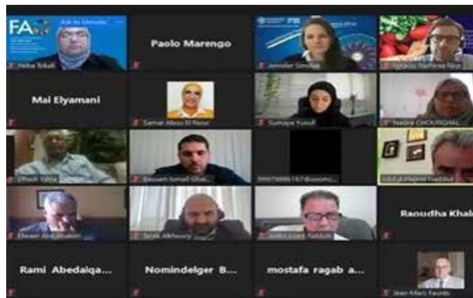
The online discussion in progress

AGU was represented by the university's Graduate Studies College Natural Resources and Environmental Environmental