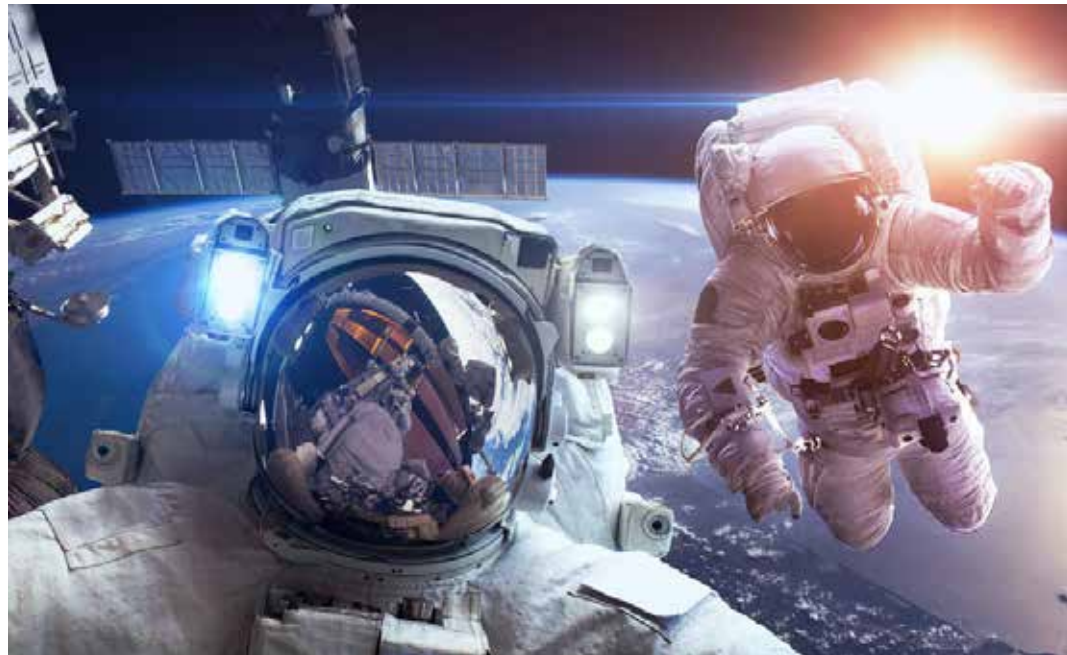
The agreement will shape Bahrain's vision for the advancement of space science

"The MoU aims to provide collaborative activities and reviewing areas of common interest for both entities through implementation of joint projects, developing researches, exchanging information and expertise, training and capacity building,