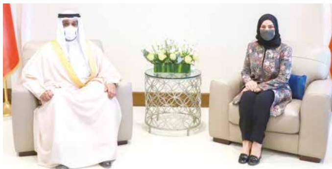
Speaker with the Finance Minister