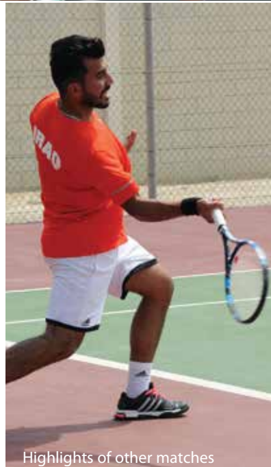
Highlights of other matches

Bahrain first entered the Davis Cup in 1989 and have four times been in Group II of the regional zones.