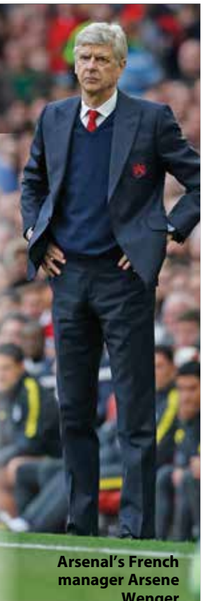
Arsenal's French manager Arsene Wenger

There was no update on Wenger's future, but in a sign he may be starting to think about life after Arsenal, he vowed to "always support the club".