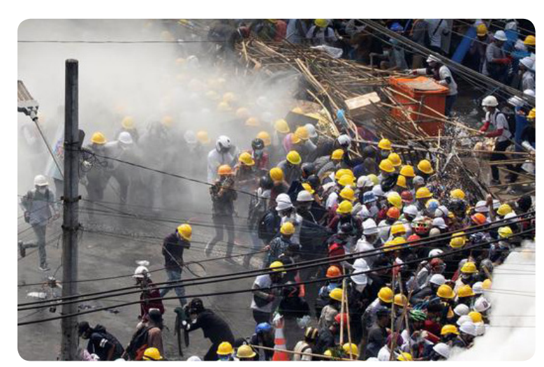
Protesters cover with makeshift shields during an anti-coup protest in Mandalay