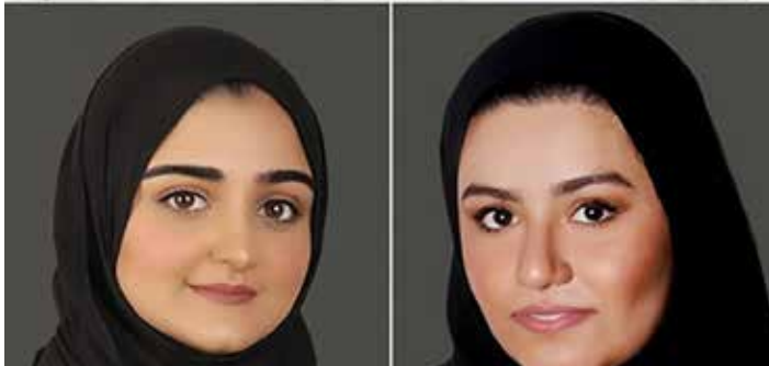
NSSA engineers and technicians