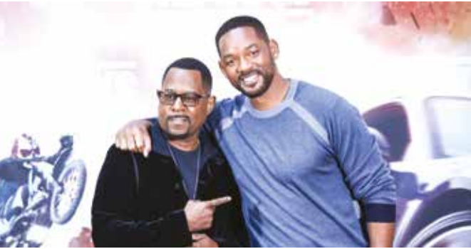
Martin Lawrence and Will Smith

Will Smith and Martin Lawrence announced the film through a video on social media with the