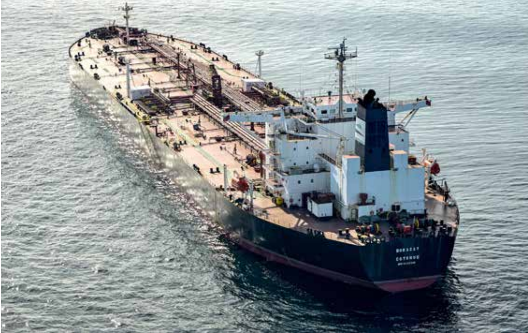
the tanker Boracay from Russia's so-called "shadow fleet" suspected of being involved in drone flights over Denmark which sailed off the Danish coast between September 22 and 25

It was not immediately clear if the captain would be released under certain conditions or if the Russia-linked ship could go