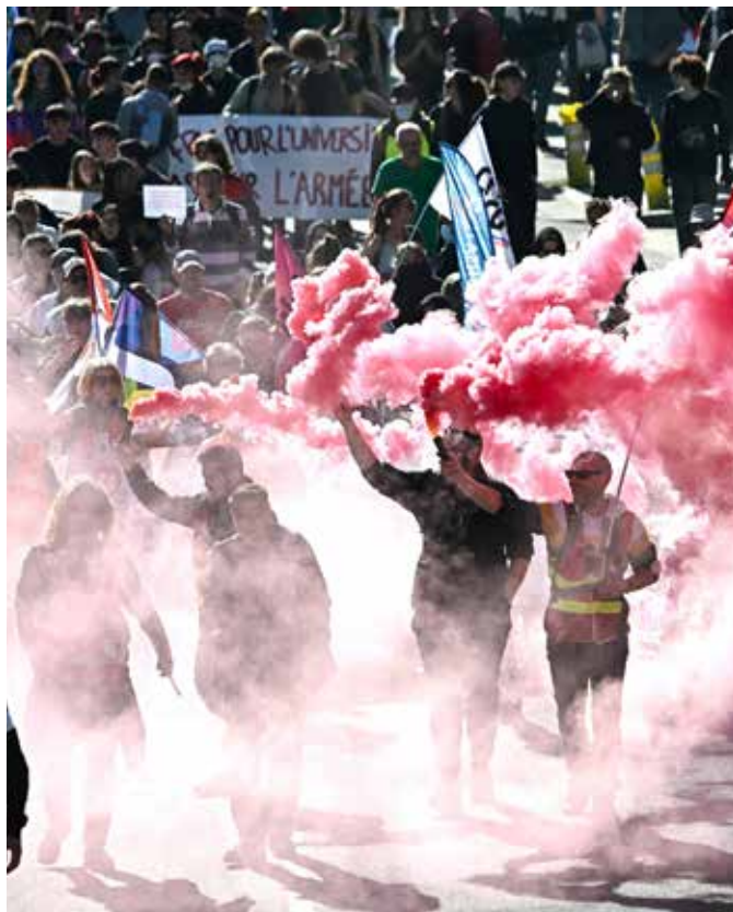
Protestors light up red smoke flares as they take part in a demonstration in Nantes, western France, as part of a nation-wide day of strike called by France's eight biggest workers unions for "social justice" measures.