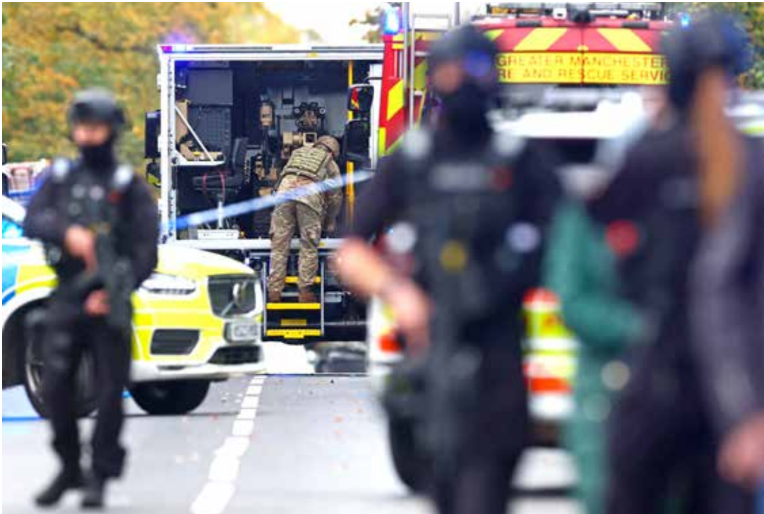
Members of the Armed Forces prepare a bomb disposal robot inside a Police cordon outside Heaton Park Hebrew Congregation synagogue in Crumpsall, north Manchester

King Charles III said he and Queen Camilla were "deeply shocked and saddened to learn