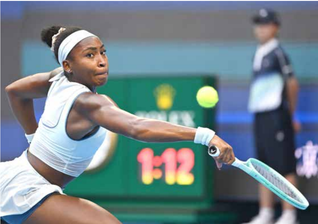
USA's Coco Gauff hits a return to Germany's Eva Lys

Defending champion Coco Gauff brushed aside unseeded Eva Lys in straight sets yesterday to power into her third consecutive China Open semi-final. The 21-year-old won 6-3, 6-4 and the world number three next plays US Open finalist Amanda Anisimova in an all-American affair in Beijing. “I’m happy with how I played today,” Gauff, seeded two, said. “(Lys is) a tough opponent.” “She hit some incredible shots off the run, so I was just trying my best to stay aggressive.” After an even start to their quarter-final Gauff began to seize control, winning the first set when the German fired long.