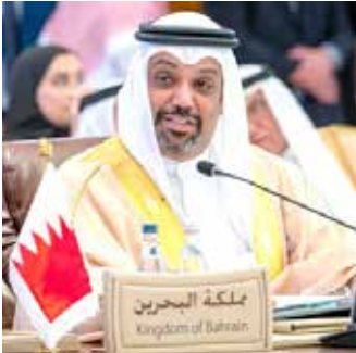
H.E. Shaikh Salman bin Khalifa Al Khalifa

His Excellency Shaikh Salman bin Khalifa Al Khalifa, Minister of Finance and National Economy, headed the Kingdom of Bahrain's delegation in the 124th meeting of the Financial and Economic Cooperation Committee of the Gulf Cooperation Council countries. The meeting was held in the State of Kuwait with the participation of GCC finance ministers and Jasem Mohamed Albudaiwi, Secretary General of the GCC.