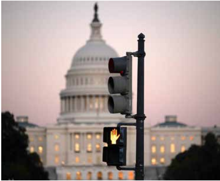
A crosswalk signal of a traffic light flashes backdropped by the US Capitol in Washington

Trump has emphasized that he views cutbacks as a way of