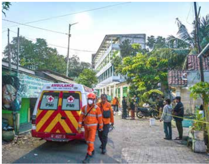
Rescue personnel walk in a cordoned-off area at the Al Khoziny Islamic boarding school in Sidoarjo

boarding school on the main island of Java collapsed suddenly on Monday as students gathered for afternoon prayers.