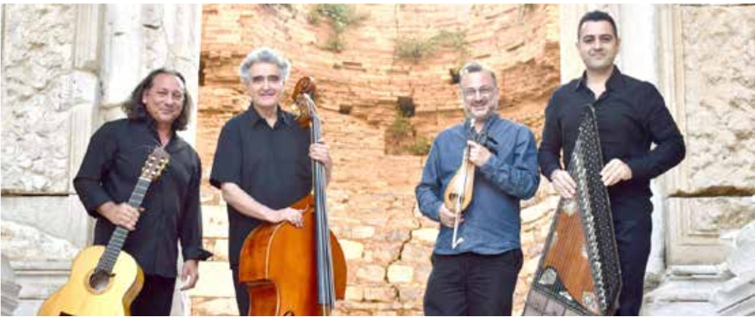
Presenting an original repertoire blending Eastern and Mediterranean traditions

The ensemble is led by acclaimed French double bassist Renaud Garcia-Fons, renowned internationally for his virtuosity and innovative approach to