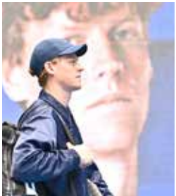
Italy's Jannik Sinner

four-time Shanghai champion Novak Djokovic. “I have only one practice session to get ready, but let’s see,” Sinner said. “It’s going to be a very, very difficult and tough challenge, especially the first (match)... you never know what’s going to happen.”