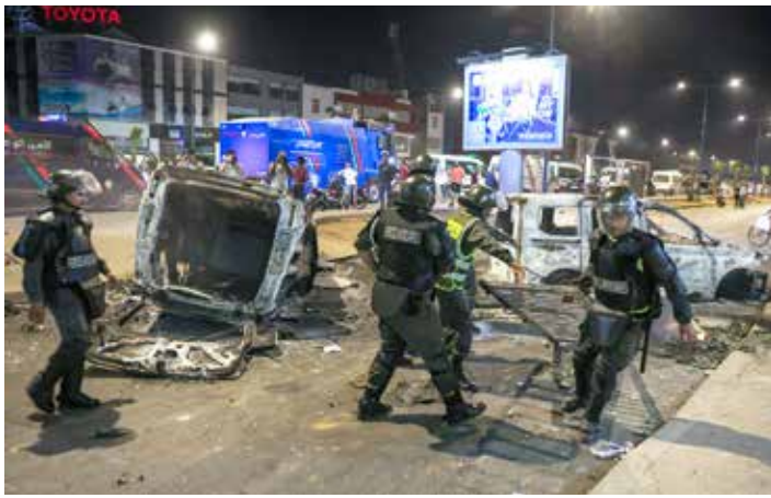
Members of the security forces remove debris near vehicles set on fire during a youth-led demonstration