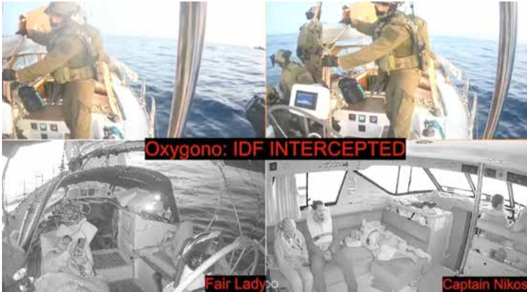
This video grab taken from a livestream broadcasted by the Global Sumud Flotilla shows Israeli navy soldiers boarding the vessel 'Oxygono', one of the Sumud flotilla boats.

The Global Sumud Flotilla of around 45 vessels began its voyage to Gaza last month, with politicians and activists includ-