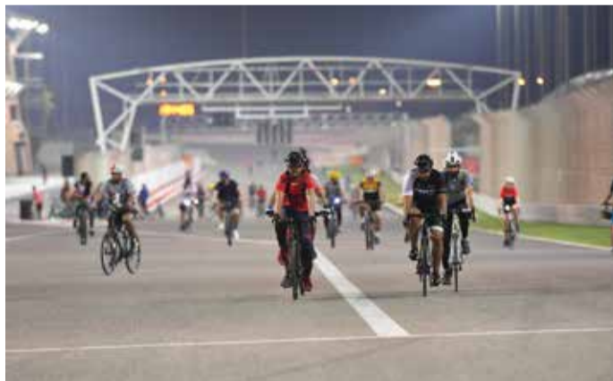
Participants ride their cycles at BIC (file photo)

BIC is expecting the activity to be hugely popular with fans