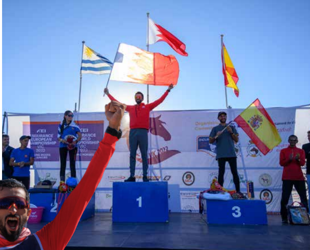
HH Shaikh Nasser bin Hamad Al Khalifa raises the Bahrain flag atop the podium alongside riders from Uruguay and Spain

Hamad bin Isa Al Khalifa, the King of the Kingdom of Bahrain, and this played a key role in spurring HH Shaikh Nasser to increase his efforts en route to winning the race.