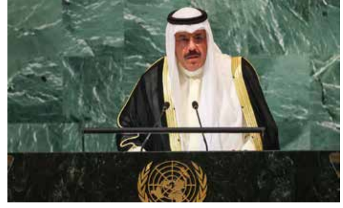
Sheikh Ahmad Nawaf Al-Ahmad Al-Sabah, Prime Minister of Kuwait

Reuters Kuwait's crown prince accepted the government's resignation yesterday following a parliamentary election in the Gulf Arab country in which opposition candidates made considerable gains, state news agency KUNA reported. Crown Prince Sheikh Meshal al-Ahmad al-Sabah, who has taken over most of the ruling emir's duties, asked the outgoing government headed by Prime Minister Sheikh Ahmad Nawaf al-Sabah to remain in a caretaker capacity until a new cabinet is formed. Kuwait, an OPEC oil producer, held early elections on Sept. 29 after Sheikh Meshal dissolved parliament in a bid to end a political standoff between the government and the legislature that has hindered fiscal reforms. The crown prince had appointed Sheikh Ahmad prime minister in July after opposition lawmakers in the dissolved parliament pressed for a new premier and for the removal of the parliament speaker, who bowed out of the September polls. Stalemates between Kuwait's government and parliament have often led to cabinet reshuffles and dissolutions of the legislature over the decades, hampering investment and reforms.