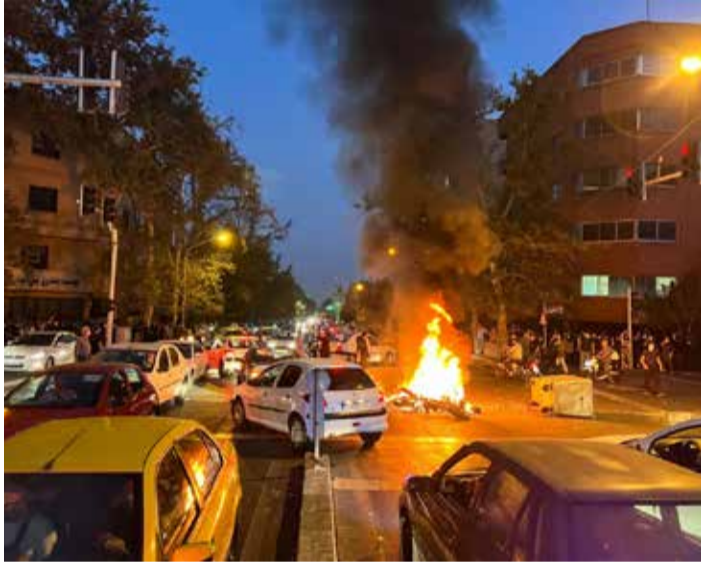
A police motorcycle burns during a protest over the death of Mahsa Amini, a woman who died after being arrested by the Islamic republic's "morality police", in Tehran, Iran

Reuters | Dubai Iranian lawmakers chanted "thank you, thank you, police" during a parliament session yesterday, amid weeks of anti-government protests across Iran following the death of a young woman in police custody, Iranian state media reported.