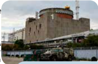
IAEA head seeks release of Ukrainian nuclear plant head