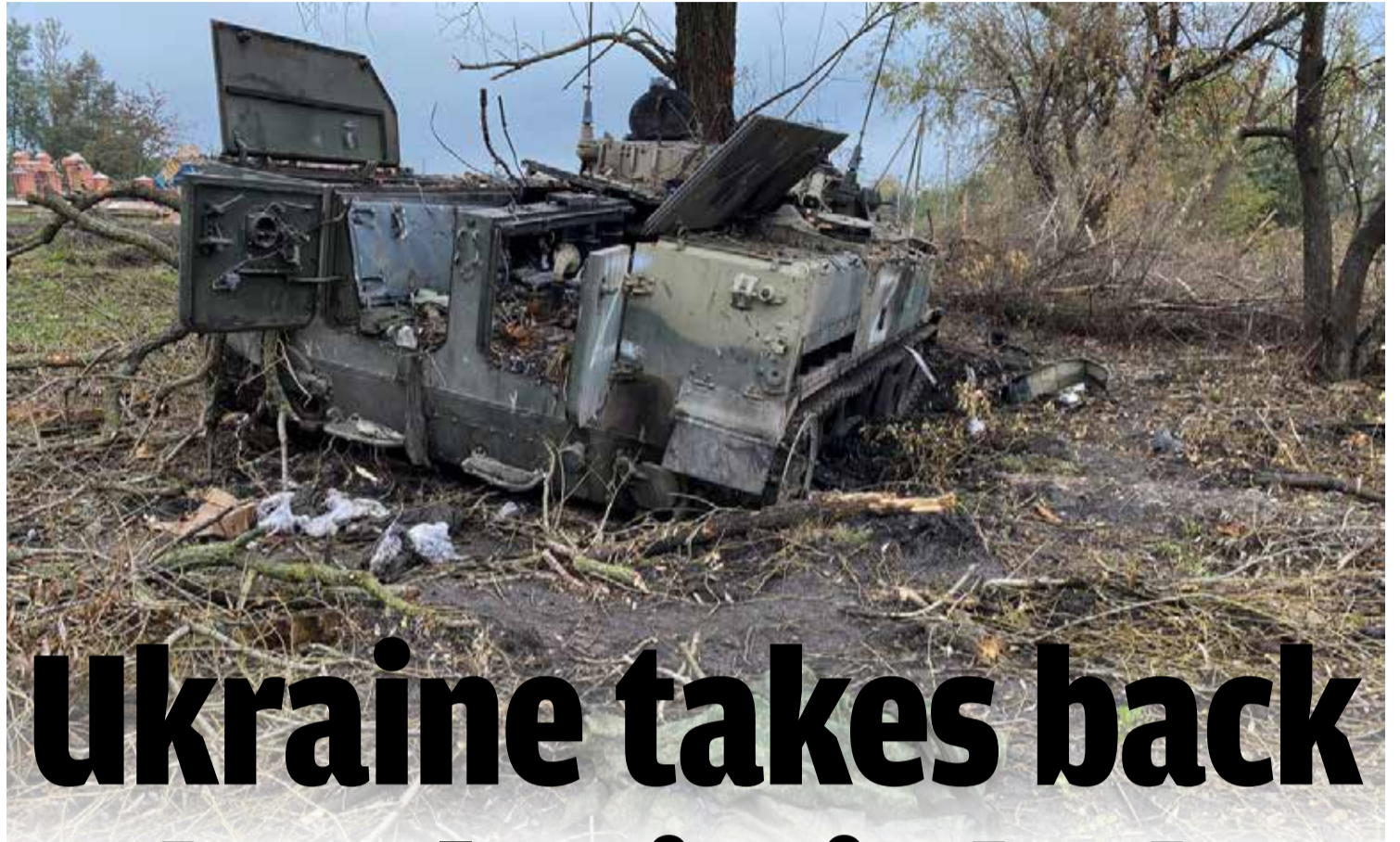
Military uniform lays next to an abandoned Russian infantry fighting vehicle BMD-4 in the village of Kurylivka

between the enemy countries and prod them toward accommodation, U.S. envoy Amos Hochstein last week submitted a new proposal that would pave the way for offshore energy exploration. Israeli approval of the draft awaited legal review, Prime Minister Yair Lapid told his cabinet at its weekly session.