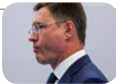
Russian Deputy PM says restoration of Nord Stream possible - TASS

Alexander Novak said yesterday that it was technically possible to restore the ruptured offshore infrastructure of the Nord Stream gas pipelines, TASS news agency reported. A total of four leaks were discovered last week on the Nord Stream 1 and 2 pipelines in the Baltic Sea near Denmark and Sweden, with a significant fall in gas pressure leading to the detection of the ruptures. "There have never been such incidents. Of course, there are technical possibilities to restore the infrastructure, it takes time and appropriate funds. I am sure that appropriate possibilities will be found," Novak said.