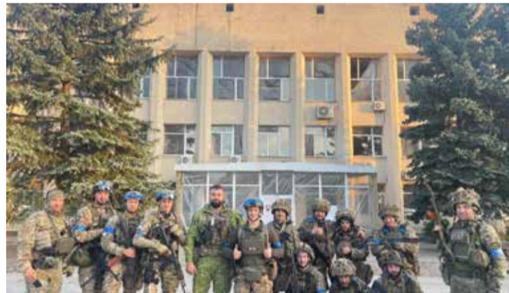
Ukrainian troops pose for a photo in Lyman, Ukraine

● Loss triggers Russian criticism, call for escalation