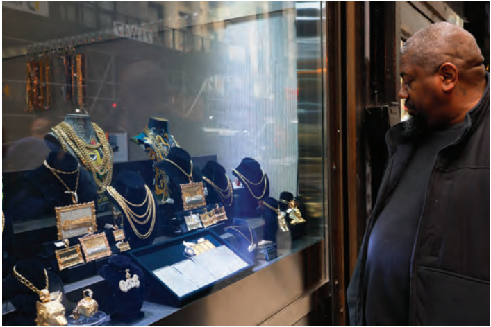
People look at jewelry on display at a jewelry store in the Diamond District in New York City

ing her challenge on Tuesday. The case has major implications for the US central bank and its independence. “Investors are increasingly concerned about President Trump's interference with the