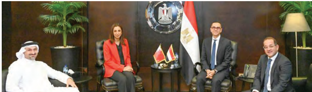
HE Noor bint Ali Al-Khulaif and HE Abdulla bin Adel Fakhro with key Egyptian officials

ticipation of senior government officials from both countries including HE Noor bint Ali Al-Khulaif, Minister of Sustainable Development, Chief Executive of Bahrain EDB; HE Abdulla bin Adel Fakhro, Minister of Industry and Commerce of the Kingdom of Bahrain; HE Eng. Hassan El Khatib, Minister of Investment and Foreign Trade of the Arab Republic of Egypt; HE Ahmed Kojak, Minister of