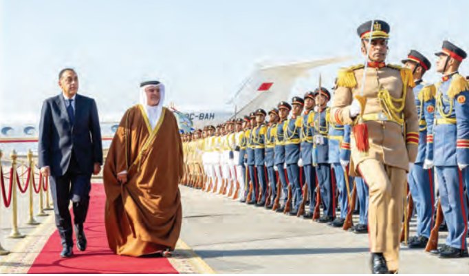
HRH Prince Salman is received by Egyptian Prime Minister Dr Mostafa Madbouly upon his arrival

His Royal Highness also conveyed his support for Egypt's honourable stances and its pivotal role in supporting Arab