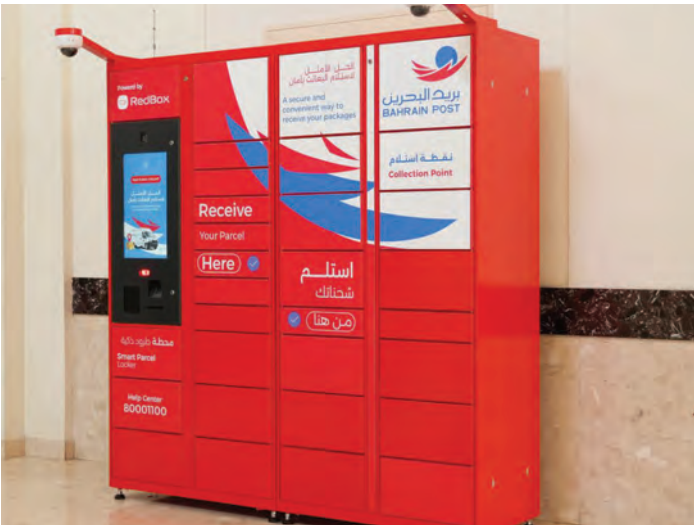
Bahrain Post's electronic locker service is a flexible, on-your-time model

Freedom from Counters Instead of being tied to office schedules, customers will now receive a secure code on their phones, enabling them to pick