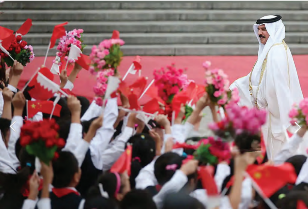
His Majesty King Hamad during a welcoming ceremony in September 2013

His Majesty underscored that education has always been a key national priority for the Kingdom, pointing to the notable achievements the sector has made over the years. HM praised the government, led by His Royal Highness Prince Salman bin Hamad Al Khalifa, the Crown Prince and Prime Minister, for its continued support that has