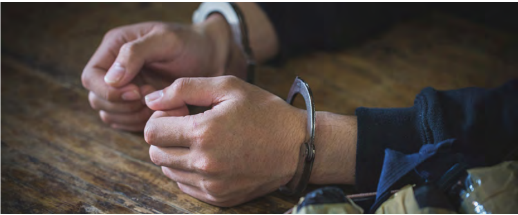
How the bust happened

The High Criminal Court has opened the trial of three Asian men accused of importing cannabis into Bahrain, with investigators alleging that a previously deported man was the ringleader of the smuggling operation. The case, which came to light at Bahrain International Airport, underscores how deported individuals can still orchestrate criminal activity from afar, according to details released by the Public Prosecution. Court proceedings The court convened to begin the process, scheduling September 9 to notify the third defendant, appoint legal counsel for the second, and allow the defense of the first defendant to review the case. The men, aged 23, 26 and 30, are accused of bringing cannabis into the kingdom in 2025 with intent to traffic.