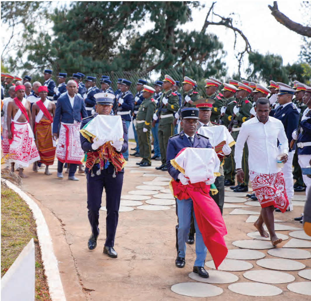
The three Sakalava skulls are carried by Madagascar security servicemen during the State Ceremony for their restitution to Madagascar from France at the Mausoleum in Antananarivo

Held in three boxes draped with the flag of the Indian