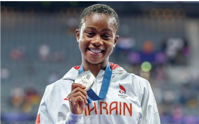
Salwa Naser poses with her 2024 Olympic silver medal

13 to 21. Around 2,000 athletes from 200 countries are expected to compete. Leading the delegation is Olympic gold medallist Winfred Yavi, the 3,000m steeplechase champion who set a new Olympic record of 8:52.76 in Paris 2024 and won World Championship gold in Budapest with 8:54.29. Salwa Eid Naser, silver medallist in the 400m at Paris 2024, is another standout. She is a former world champion (Doha 2019, 48.14) and recently claimed first place in the 400m at the 2025 Diamond League in Zurich (48.70), making her