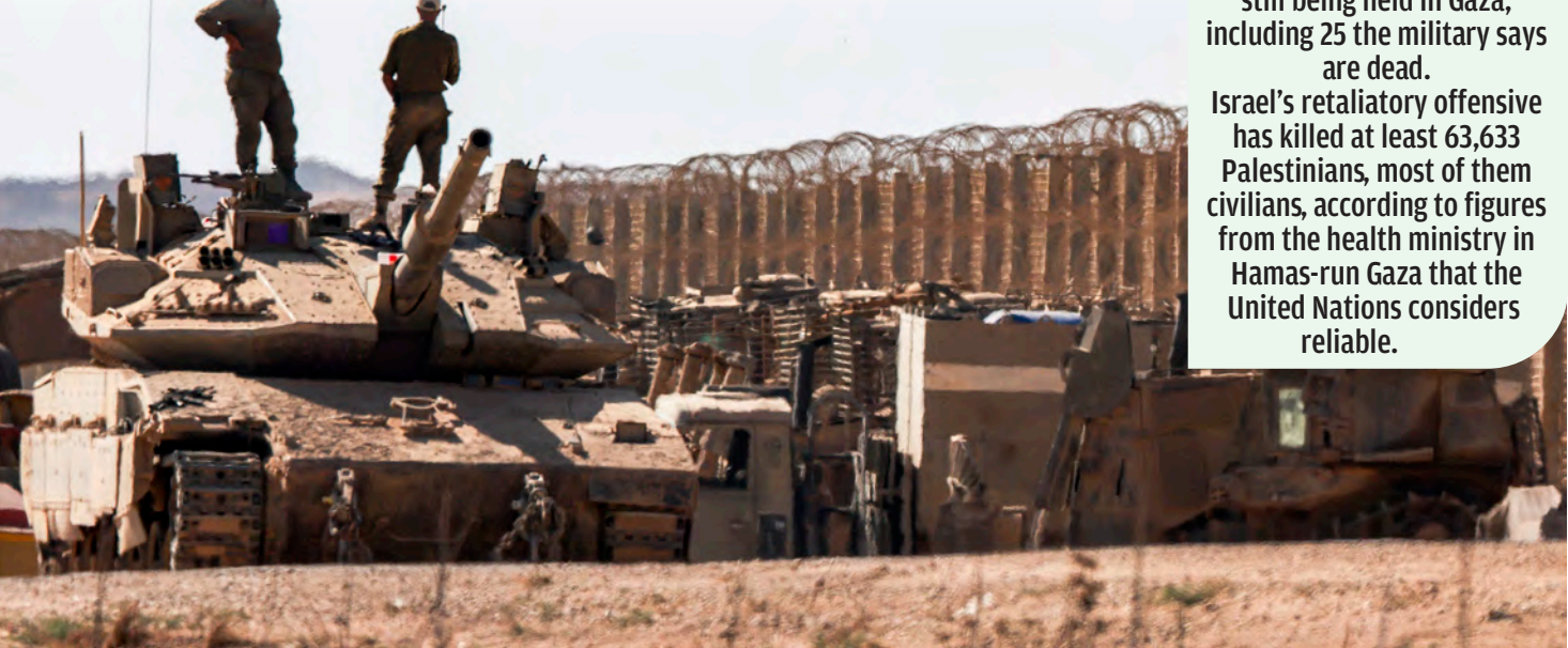
Israeli army soldiers stand atop the turret of a Merkava main battle tank positioned near armoured military bulldozers along the border with the Gaza Strip in southern Israel

Hamas’s October 2023 attack on Israel resulted in the deaths of 1,219 people, mostly civilians, according to an AFP tally based on Israeli figures. Of the 251 hostages seized during the assault, 47 are still being held in Gaza, including 25 the military says are dead. Israel’s retaliatory offensive has killed at least 63,633 Palestinians, most of them civilians, according to figures from the health ministry in Hamas-run Gaza that the United Nations considers reliable.