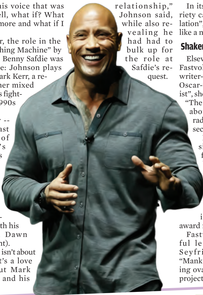
Dwayne “The Rock” Johnson

Fastvold embraced tearful lead actress Amanda Seyfried (“Mean Girls”, “Mank”) during a long standing ovation at the end of the projection.