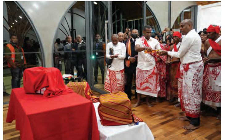
The three Sakalava skulls are placed in front of descendants of the Sakalava King Toera as they prepare to asperge them with red wine during a welcome ceremony

"It is a source of pride and immense inner peace that my ancestor is back among us," a