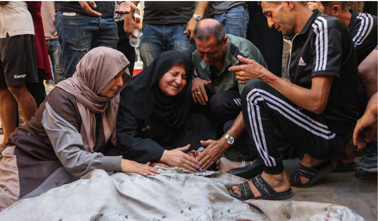
Palestinians mourn by the body of a relative killed in Israeli strikes on Gaza City at dawn, at the Al-Shifa hospital

Nearly a million people live in Gaza City and its surroundings