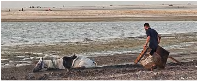
A resident saves horse from sinking ground

People living near the spot said the clay poses a danger