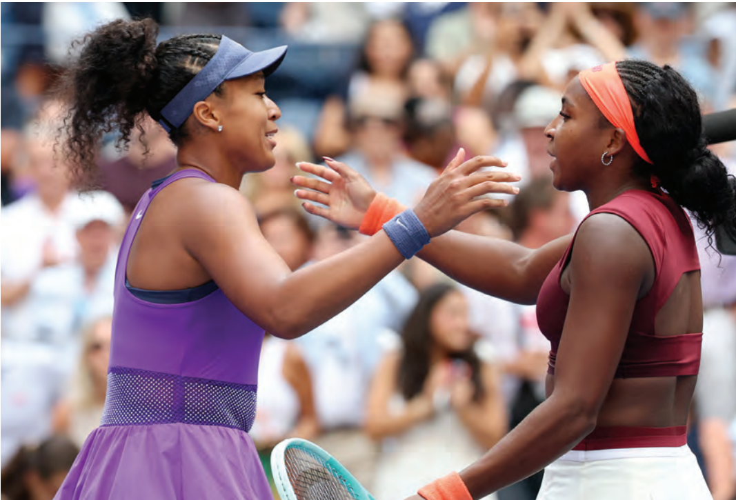
Japan's Naomi Osaka (L) and USA's Coco Gauff hug at the net

It has been a painstaking climb back towards the top of the game for Osaka, who returned to tennis last year following the birth