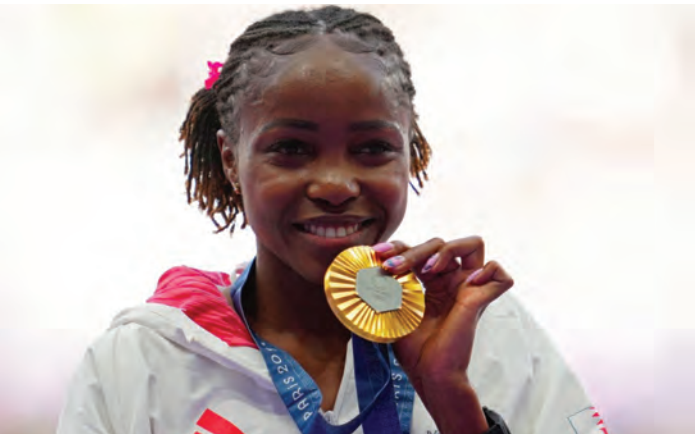
Winfred Yavi poses with her 2024 Olympic gold medal

Olympic champions Yavi and Salwa lead a strong Bahraini squad to Tokyo