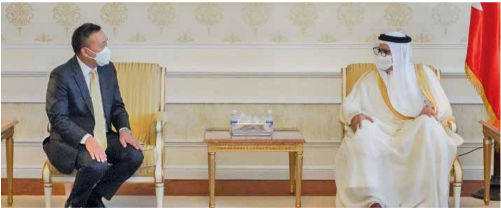
Foreign Affairs Minister Dr Abdullatif bin Rashid Al Zayani received in his office at the Ministry yesterday the Deputy Permanent Secretary of the Ministry of Foreign Affairs of Kingdom of Thailand, Dusit Manapan, on the occasion of his visit to the Kingdom of Bahrain to take part in the follow-up meeting of the Bahraini-Thai Joint Committee. The meeting affirmed the deep-rooted friendly relations between Bahrain and Thailand, which are constantly developing thanks to the mutual keenness of both countries to enhance bilateral cooperation in various fields.

countries. He praised the distinguished level of relations between the two countries. Thai Foreign Ministry Deputy Permanent Secretary affirmed his country's aspiration to enhance friendly relations and cooperation with Bahrain, wishing the Kingdom further progress and prosperity. The two sides also exchanged views on issues of common interest during the meeting.