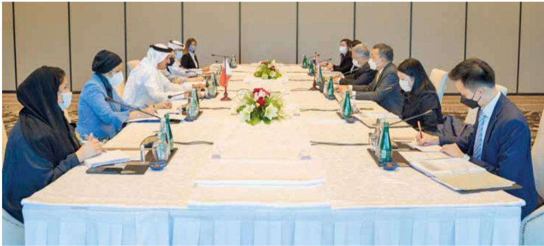
The meeting in progress