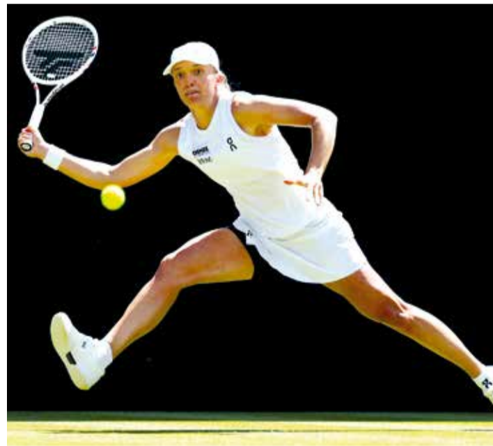
Poland's Iga Swiatek returns against Czech Republic's Karolina Pliskova

Britain's future queen Princess Catherine attended the tournament yesterday, greeting fans before watching some of the