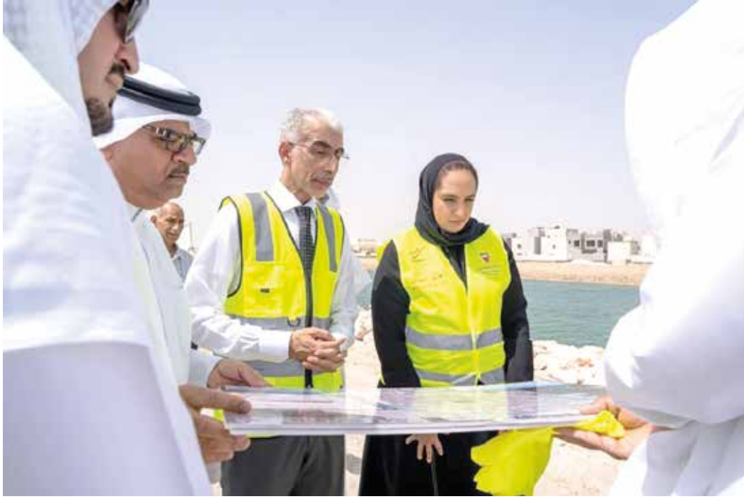
Ministers during the inspection visit

The first phase includes Sheikh Salman bin Ahmed Al-Fateh Street rehabilitation over