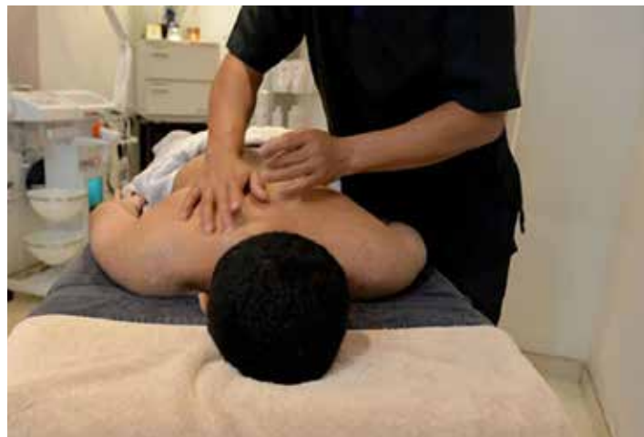
Representative picture

The suspect was caught red-handed during the opera-