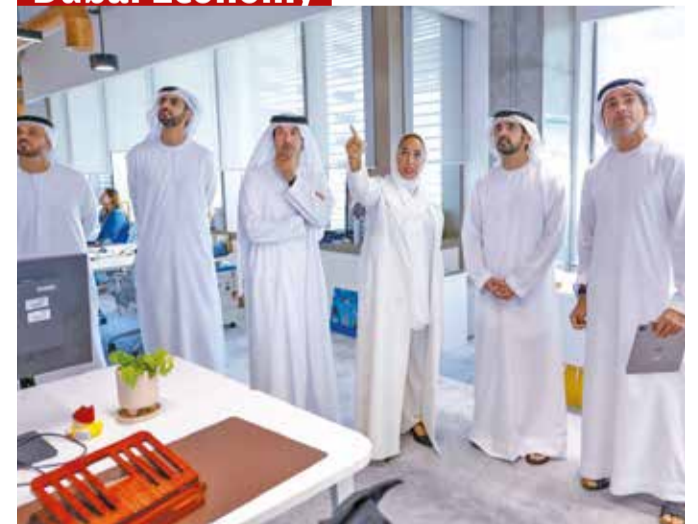
HH Shaikh Hamdan bin Mohammed bin Rashid Al Maktoum visits the Department of Economy and Tourism in Dubai to review progress and plans aimed at accelerating economic growth and strengthening the emirate's position as a global hub for trade, tourism, and investment.