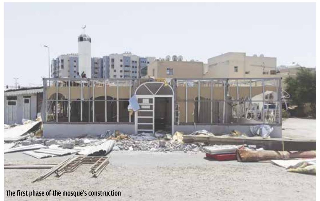
The first phase of the mosque's construction

Officials said the development will enhance access to religious services and support the needs of residents in the surrounding area.