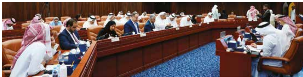
Lawmakers in session

three MPs criticised state measures taken against individuals accused of glorifying Iranian attacks on Bahrain, including the revocation of citizenship in certain cases. The signatories