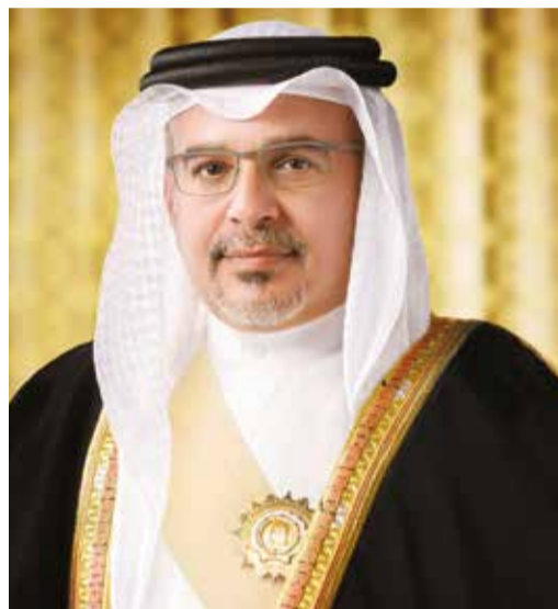
HRH Prince Salman

consistent approach based on good neighbourliness, cooperation, and balanced diplomacy.