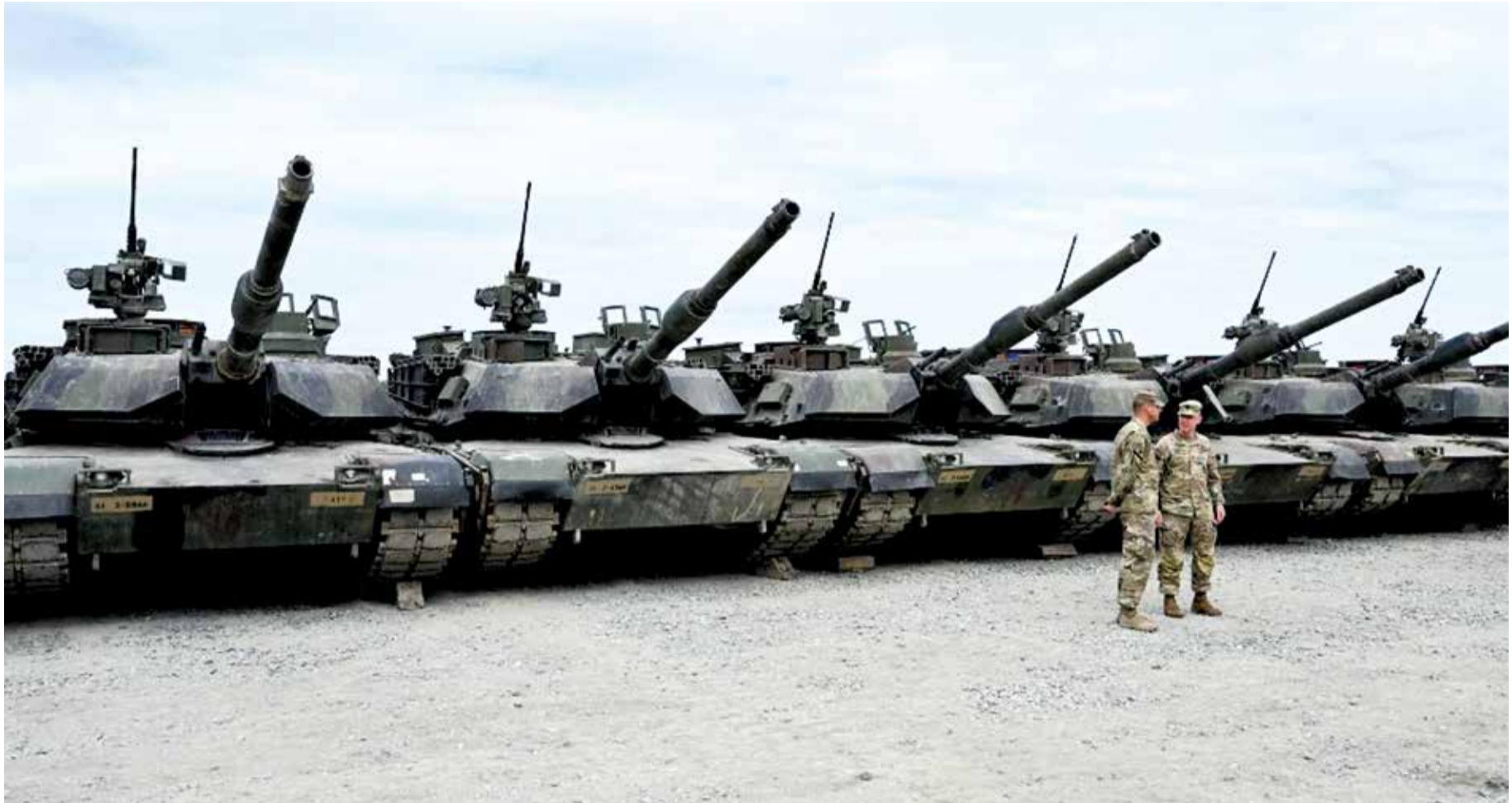
US soldiers stand in front of military tanks at the United States Army military training base in Grafenwoehr, southern Germany (file photo)