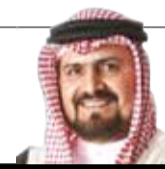
CAPTAIN MAHMOOD AL MAHMOOD

Bahrain has long distinguished itself as a regional pioneer in labour reform, consistently prioritising the dignity and mobility of its diverse workforce. Its track record is defined by a series of 'firsts' that have fundamentally reshaped the employer-employee dynamic in the Gulf.