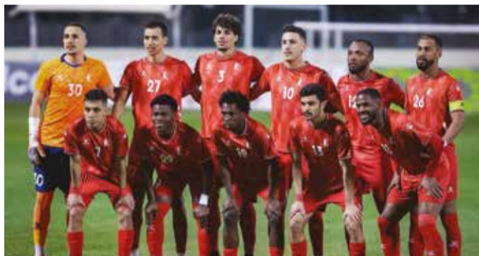
Al Ittifaq's players line up before a match