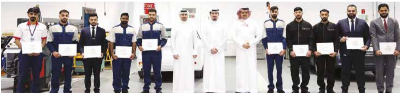
Shaikh Khalid bin Hamood Al Khalifa, Governor of Capital Governorate, described International Workers' Day as a milestone renewing appreciation for labour. He stressed workforce development, skills, and opportunity expansion to boost competitiveness and sustainable growth. On a visit to Ibrahim Khalil Kano Training Centre, he praised workers and Bahraini youth.