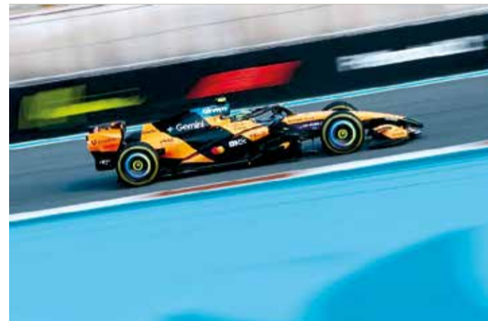
British driver Lando Norris steers his upgraded McLaren

but it's nice to kick off by doing this. We've got a lot of new upgrades on the car and it is nice to feel some grip again -- and nice to reward the guys and girls who have put a lot of work into this."