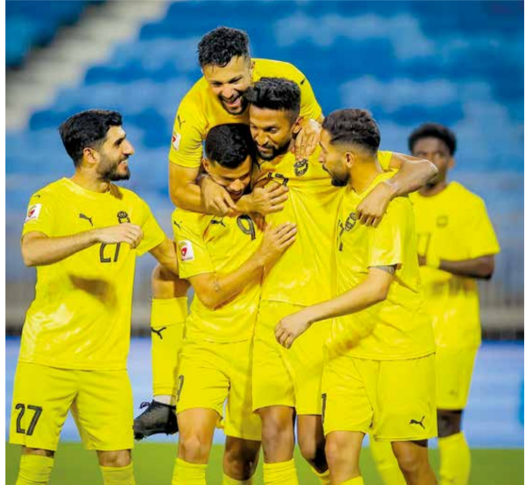
Al Khaldiya players celebrate a goal in a previous round

Elsewhere, Bahrain Club will take on Al Malkiya at Bahrain National Stadium. Bahrain Club have already been relegated after last week's results and sit bottom on 7 points; their fate is sealed. Al Malkiya are fourth