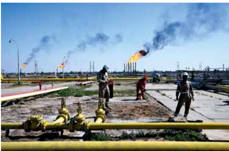
Employees of Basra Oil Company, work at the Nahr Bin Umar Oil and Gas Field on the outskirts of the southern Iraqi city of Basra

"Do we want to go and just blast the hell out of them and finish them forever -- or do we want to try and make a deal?" he