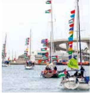
AFP | Jerusalem

Two activists who participated in a Gaza-bound aid flotilla have been brought to Israel for questioning, the foreign ministry said yesterday, after the vessels were intercepted by Israeli forces.