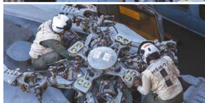
U.S. Navy Sailors conduct routine maintenance on MH-60 Sea Hawk helicopters aboard USS Abraham Lincoln (CVN 72). The MH-60 is U.S. Navy’s primary shipboard helicopter and operates from destroyers, amphibious ships, and carriers in the region.