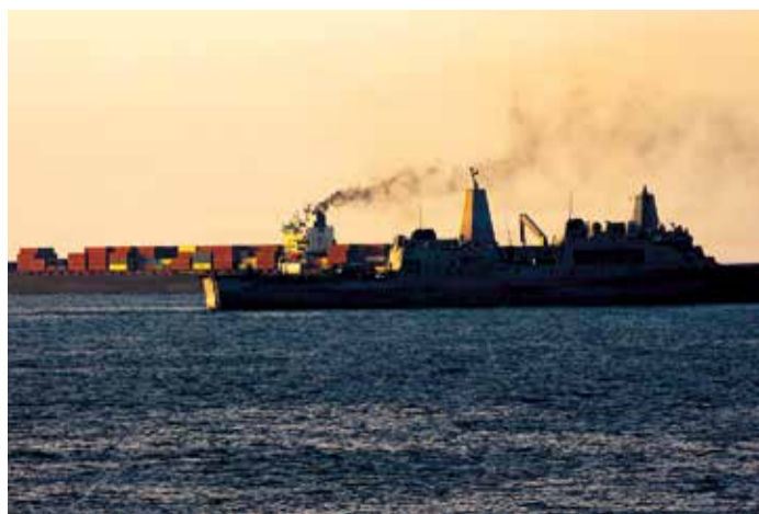
US forces patrolling the Arabian Sea near the Iranian-flagged cargo ship Touska

naval activity to piracy comes as legal experts raise alarms about Iran's blockade of the vital Strait of Hormuz and its plans to charge a fee for ships passing through it.