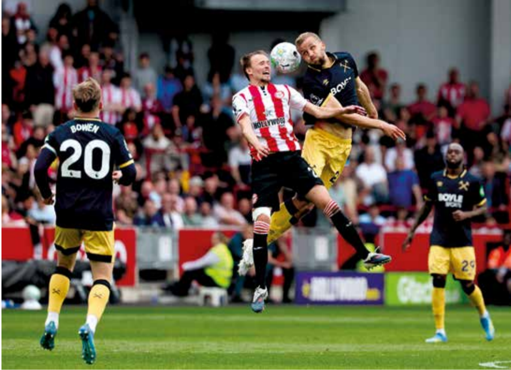
Brentford's Danish midfielder #24 Mikkel Damsgaard jumps to head the ball with West Ham United's Czech midfielder #28 Tomas Soucek

was left to rue his luck in two key first-half incidents.