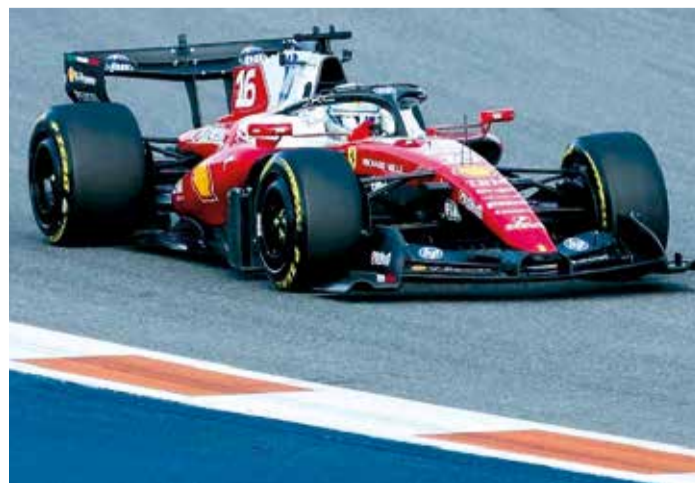
Ferrari's Monegasque driver Charles Leclerc races during Sprint qualifying

"We struggled with tires today in the heat," Leclerc said. "On mediums, we were working very well, but it was not such a nice feeling on the softs, so we