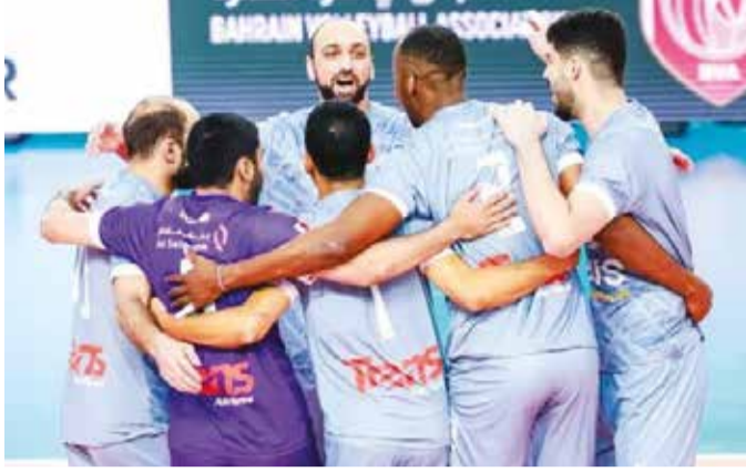
Celebration from Dar Kulaib players after a set win