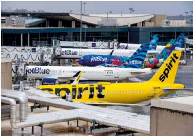
Spirit Airlines jets sit on the tarmac as operations ceased for the company at Logan Airport in Boston, Massachusetts