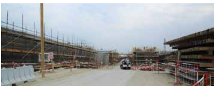
Construction work in progress

The Minister was assessing the progress of work on Phase Four of the expansion project that aims to accommodate the increased flow of waste water, taking the average daily flow capacity of 200,000 m 3 /day to