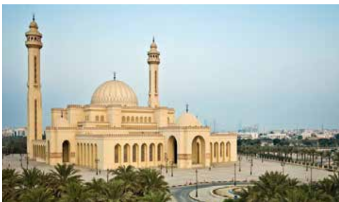
Al Fateh Grand Mosque

The Ministry stressed the importance of adhering to all precautionary measures to ensure the safety of all and added