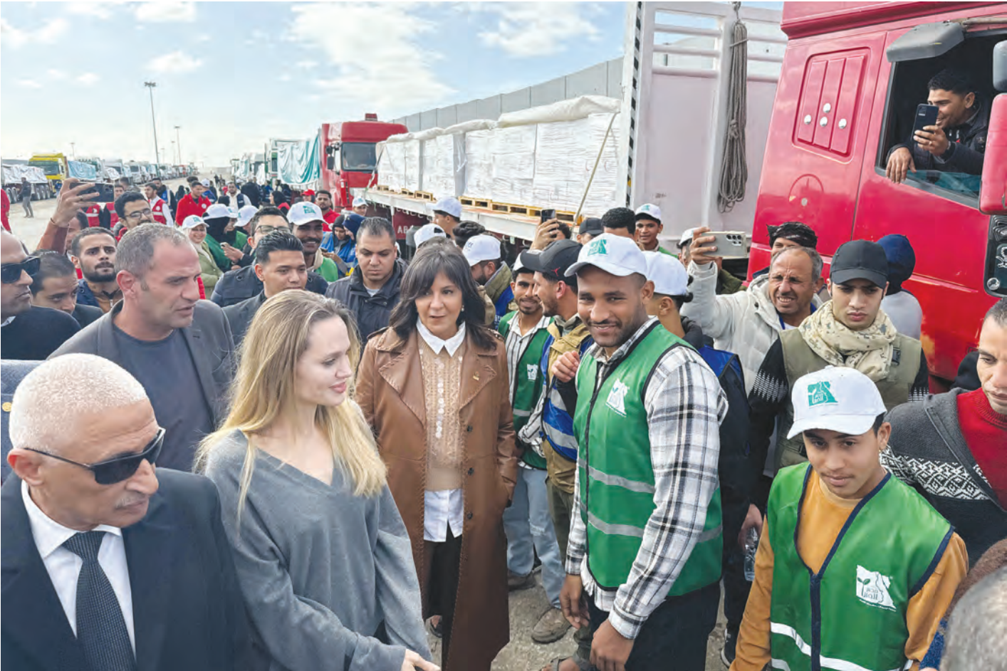
US actress Angelina Jolie speaks to employees of aid agencies at the Egyptian Rafah border crossing, part of her visit to the North Sinai Governorate to inspect aid entering the Palestinian Gaza Strip

Jolie said she was "honoured" to meet aid volunteer