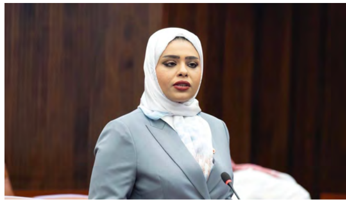
MP Hanan Fardan

In some cases, she said, that gap had led to land being treat-