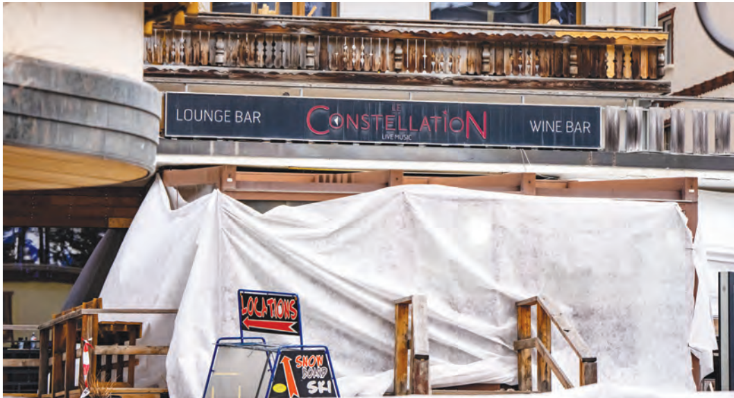
The entrance of the bar Le Constellation where a fire ripped through the venue during New Year's Eve celebrations

The flames spread with terrifying speed in the bar, in the