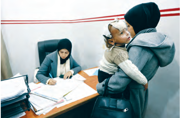
A Palestinian woman holds a child wearing a perspex protective mask as she speaks to a member of staff at the Doctors Without Borders or Medecins Sans Frontieres (MSF) clinic, in the al-Rimal neighborhood of Gaza City

MSF staff had been "killed by Israeli forces", and that access to any given territory should not be conditional on staff list disclosure.