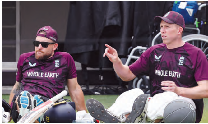
England's head team coach Brendon McCullum (L) sits with player Zak Crawley during a team training session at the SCG in Sydney