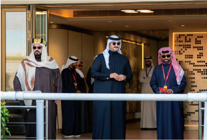
HH Shaikh Isa with senior officials at the event

A number of Their Highnesses and Excellencies, along with representatives of sponsoring