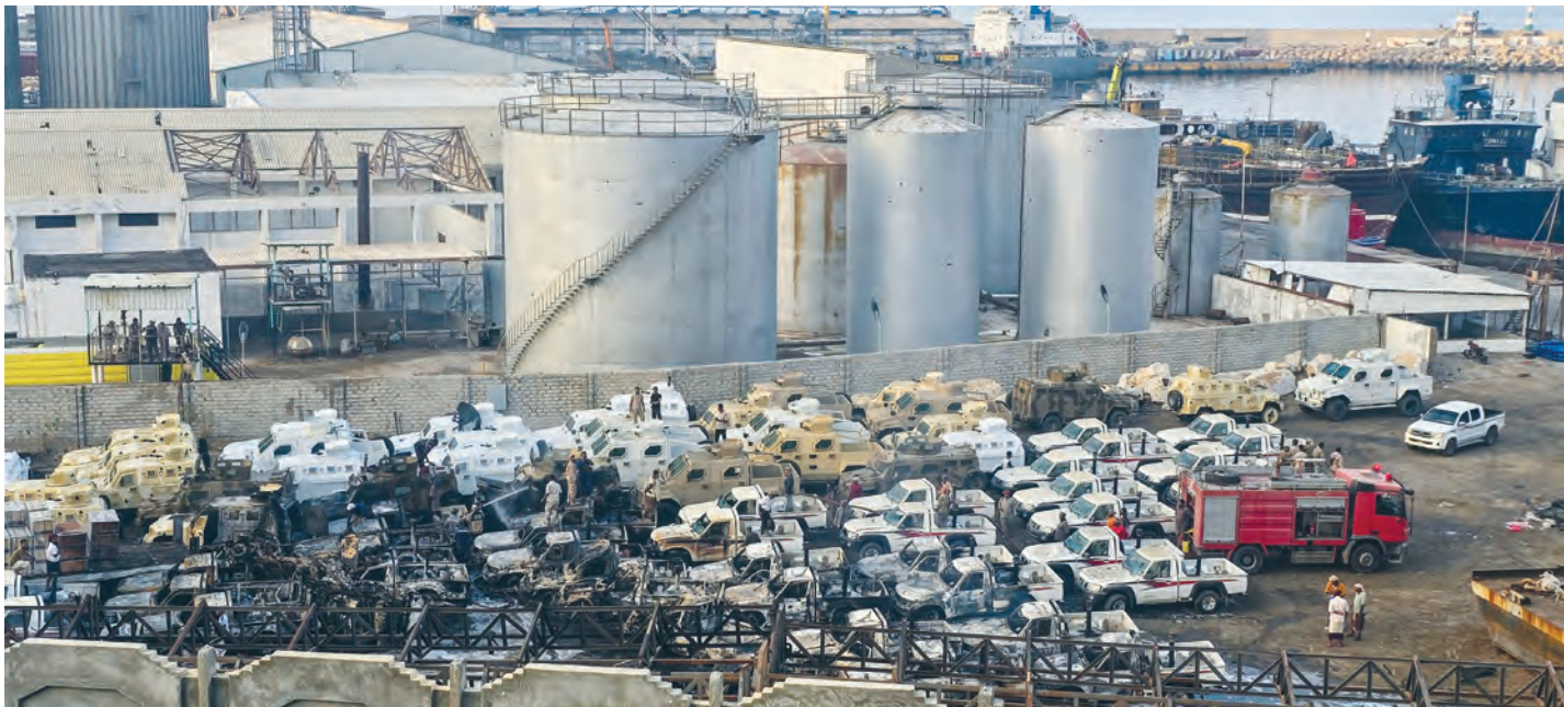
Damaged military vehicles following an air strike carried out by the Saudi-led coalition in the port of Mukalla, southern Yemen