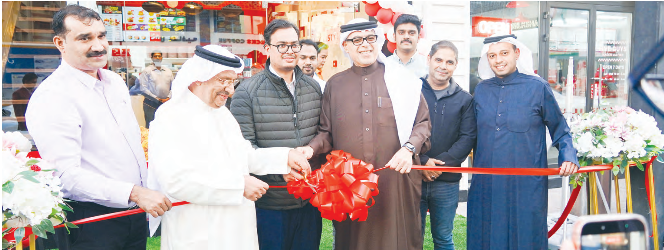
TDT | Manama

CHIKEX, the international fast-food brand known for being “Exceptionally Tasty,” celebrated the grand opening of its newest outlet in American Alley, Juffair, on December 30, 2025. This marks the com-