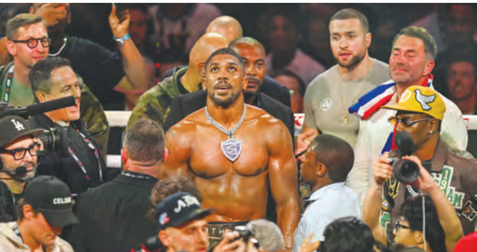
British boxer Anthony Joshua