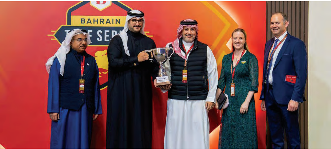
HH Shaikh Isa at the awards ceremony