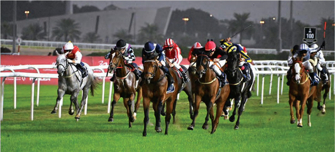
Action from the race