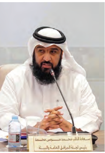
MP Mohammed Moosa

They also want the government to spell out how the Health Ministry works with other bodies, including the Interior Ministry, the Ministry of Industry and Commerce, and municipal authorities, to spot violations and take action, and what plans are in place to cut access and reduce health risks.