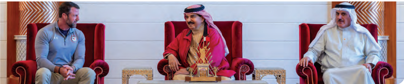
HM the King receives the US Congress delegation, led by Senator Markwayne Mullin