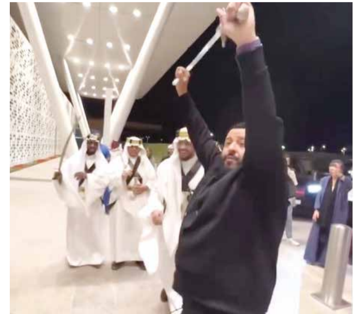
DJ Khaled dances as he is welcomed upon arrival in Saudi Arabia