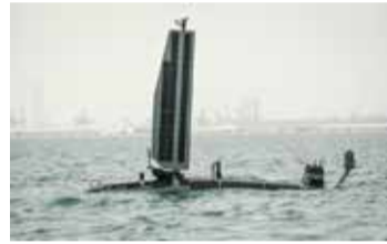
The unmanned vessel Ocean AeroTriton