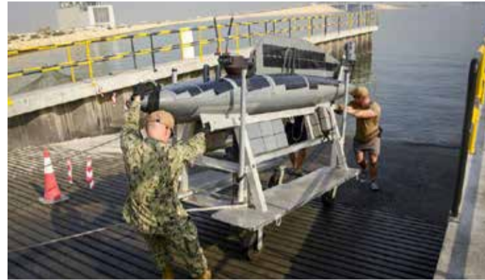
Sailors with the Navy's Task Force 59 launch a drone boat