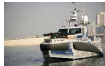
An unmanned ship in Bahrain