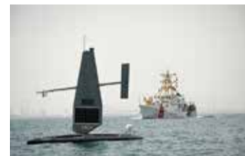
A Saildrone Explorer

Stripes.com reports that the US Navy intends to create a 100-vessel unmanned surface fleet by the end of next summer.