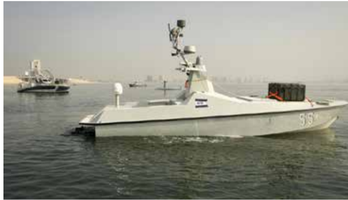
Unmanned ships with green boxes containing aerial drones.

Some drone boats, the report said, can identify objects in the water and spot suspicious behaviour. This capability allows humans to focus on priority threats, Navy Capt. Michael Brasseur, the commodore of Task Force 59, said.