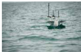
The Seasats X3