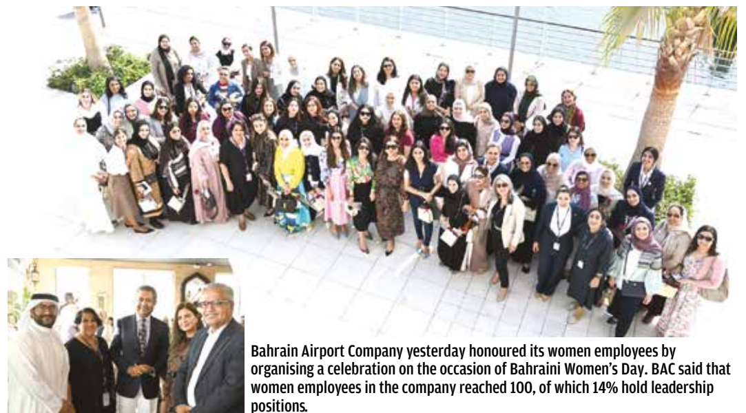
Bahrain Airport Company yesterday honoured its women employees by organising a celebration on the occasion of Bahraini Women's Day. BAC said that women employees in the company reached 100, of which 14% hold leadership positions.

Bahraini Women's day this year is celebrated with the slogan "I read - learned - participated".