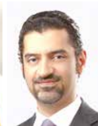
Mr Al-Mubarak, Municipal Affairs Minister