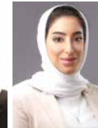
Ms Al-Sairafi, Tourism Minister