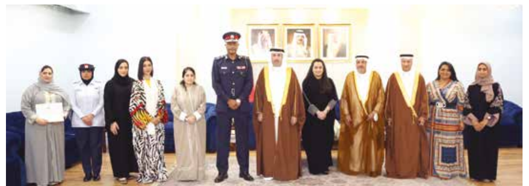
Shaikh Rashid bin Abdulrahman Al Khalifa, the Capital Governor, yesterday celebrated Bahraini Women's Day in the presence of Hassan Abdullah Al-Madani, the Deputy Governor, officials, and all the governorate's affiliates.