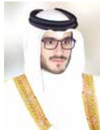
HH Shaikh Isa