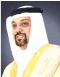
Mr Shaikh Salman, Finance Minister