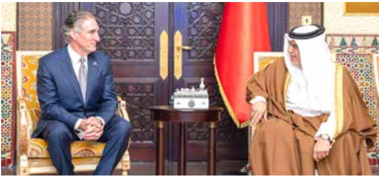
HRH Prince Salman with senior US delegates participating at the event