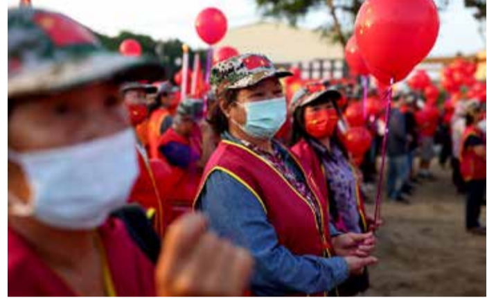
People attend the flag rising ceremony to celebrate China's national day at the base of the Taiwan People's Communist Party in Tainan, Taiwan

Two small Taiwanese groups at far ends of the debate over relations with Beijing marked China's national day yesterday with flag raisings and flag burnings, very opposite responses at a time of rising tension over the Taiwan Strait.