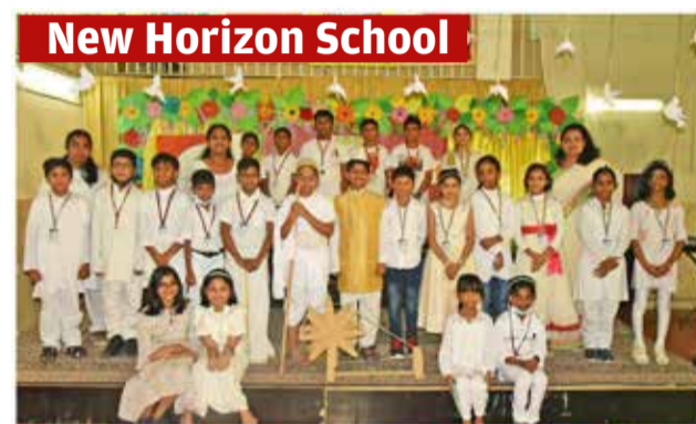
New Horizon School