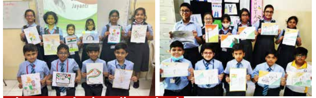
Bhavans-Bahrain Indian School

The Ecumene Forum attended by the Derasat delegation discussed several topics, among which were climate change, the economics of biodiversity, sustainable development for cities and the world, women's role in advancing sustainable development, continuous education, and other important matters.