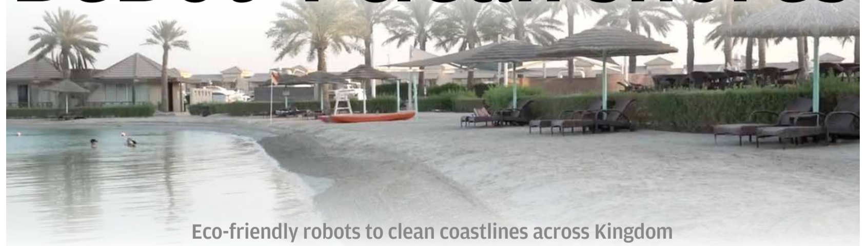
Eco-friendly robots to clean coastlines across Kingdom