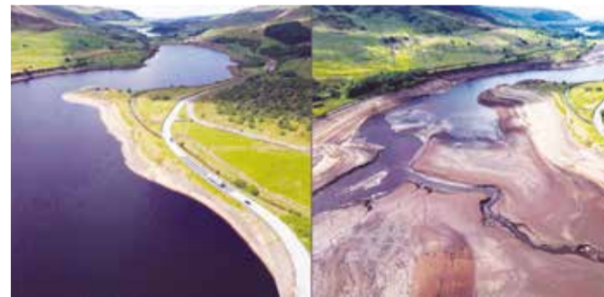
This combination of aerial pictures created on June 30, 2026 shows the high water level (L) at Woodhead Reservoir in Glossop, northern England on June 30, 2026, in contrast to the low levels (R), on June 10, in 2025.