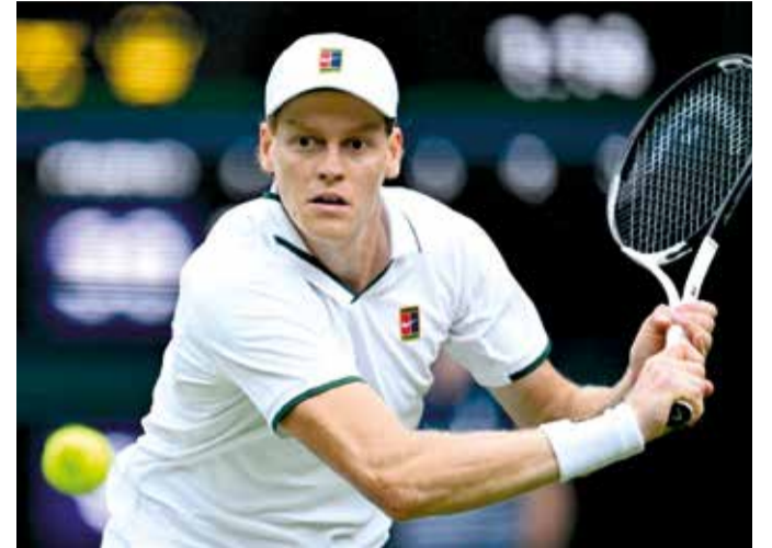
Italy's Jannik Sinner in action