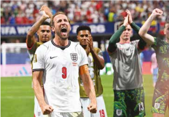
England's forward #09 Harry Kane celebrates after winning the match.

England had entered Wednesday's game with doubts swirling around their makeshift defence.