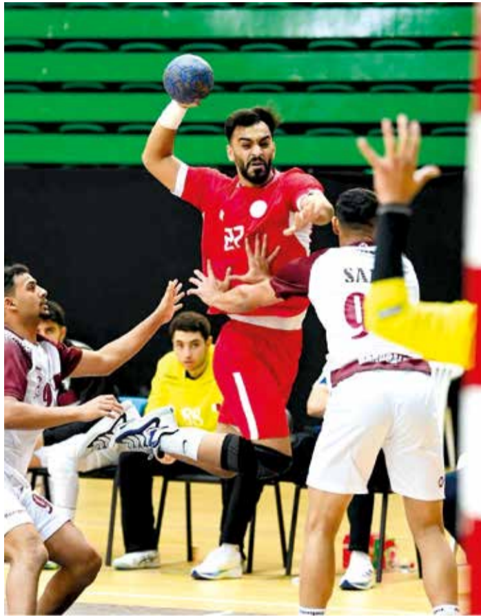
Action from the match

Bahrain ended the round-robin stage with one win, one draw