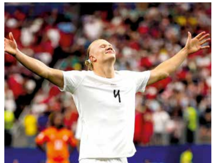
Erling Haaland #9 of Norway celebrates scoring his team's second goal