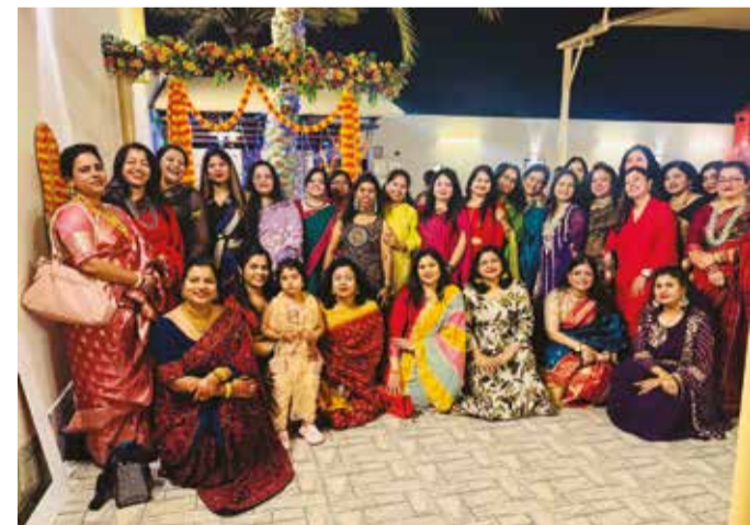
The Ladies' Team of the Bahrain Odia Samaj celebrated Odisha's iconic festival of womanhood, 'Raja', with immense joy and cultural enthusiasm at a special gathering. Attired in traditional garments, the participants honored Mother Earth and welcomed the monsoon season through vibrant cultural activities and shared festive delicacies, beautifully showcasing togetherness and cultural preservation far from home.