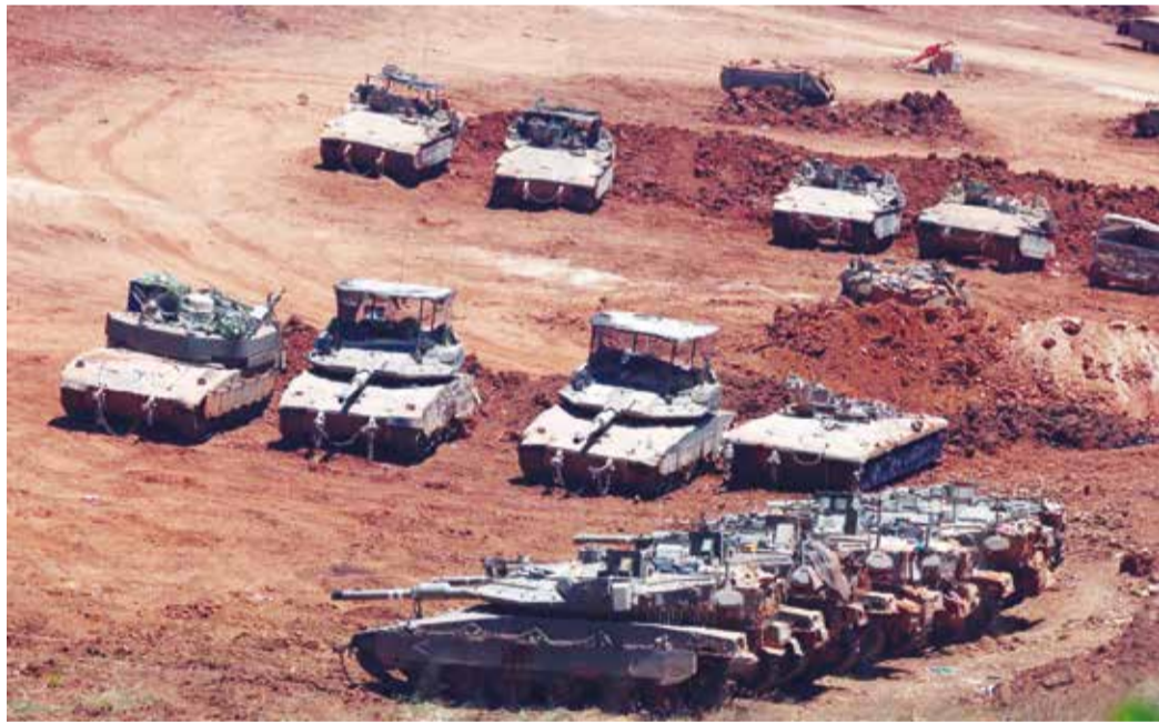
Israeli army tanks positioned along the Israel-Lebanon border