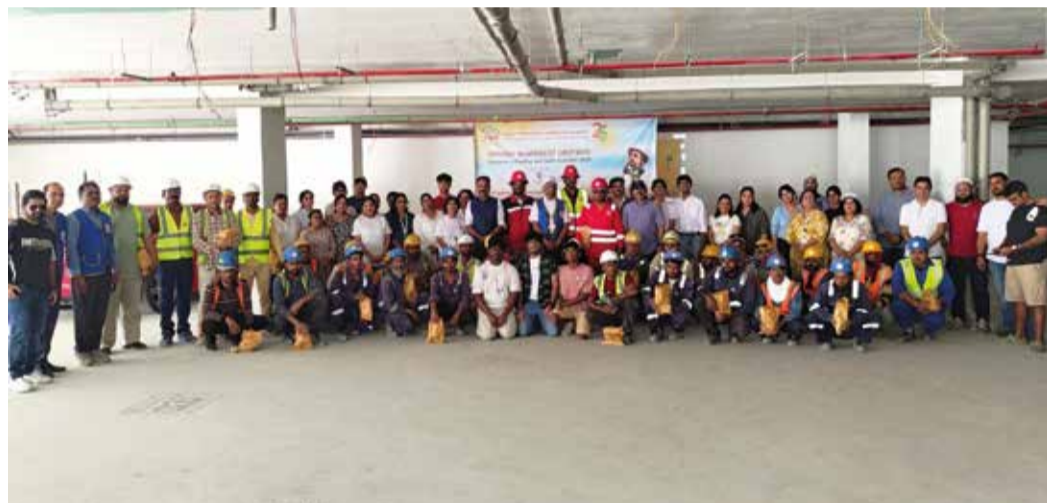
The Indian Community Relief Fund (ICRF) Bahrain officials, dignitaries from the Ministry of Labour, LMRA, and IOM, alongside volunteers and students, distribute refreshments to workers during the launch of 'Thirst Quenchers 2026' at Cebarco in Zallaq, and the second weekly drive at Mohammed Jalal Contracting in Galali. The 11th edition of the annual summer awareness initiative benefits hundreds of workers across the Kingdom, promoting health and safety during the summer months.