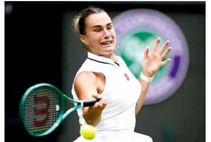
Aryna Sabalenka in action