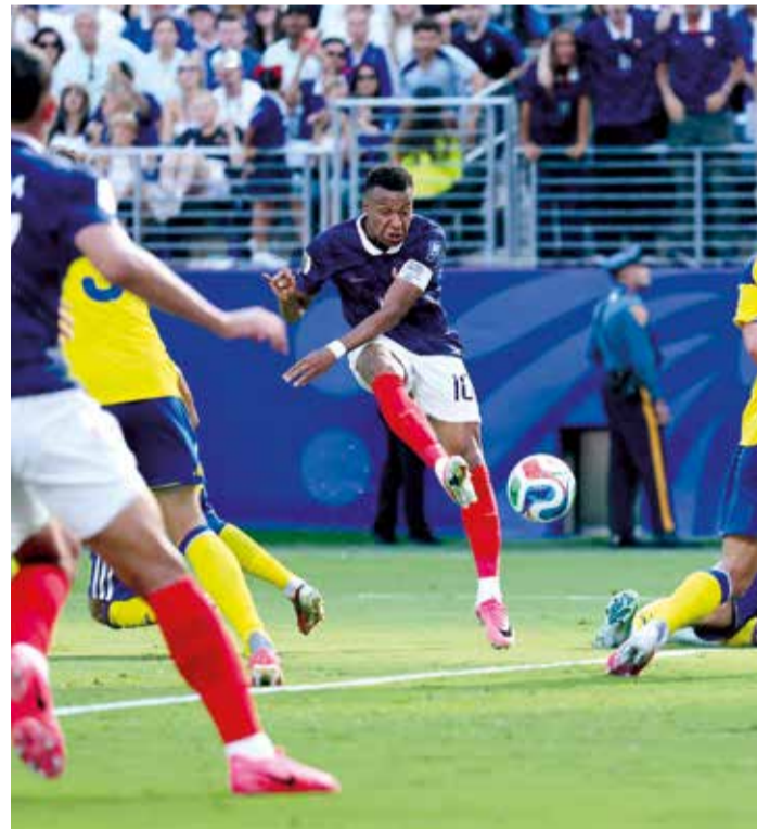
Kylian Mbappe #10 of France scores his team's first goal

The France captain now has 18 World Cup goals in total, meaning he is just one behind Messi's overall record of 19 -- a mark which 27-year-old Mbappe will keep chasing.