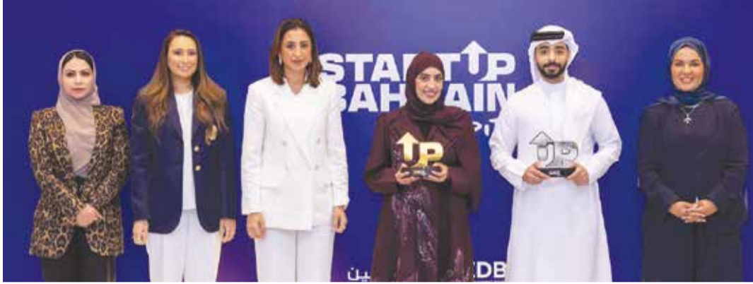
Noor bint Ali Al Khulaif, Minister of Sustainable Development and Chief Executive of the Bahrain Economic Development Board, with the award winners during the recognition ceremony

The Startup Pitch series is held in collaboration with the SMEs Development Board and provides an