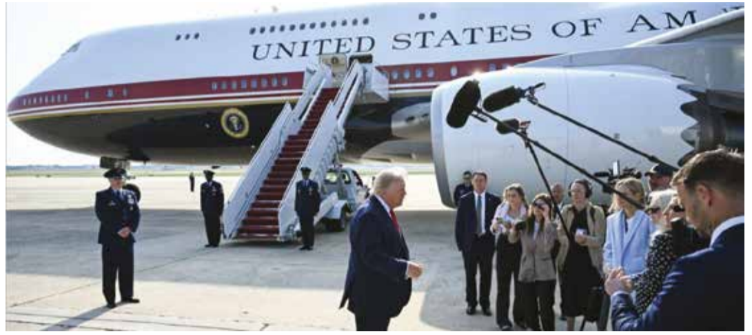
US President Donald Trump speaks to the press before he boards Air Force One for his first flight aboard the Boeing 747-8 that Qatar gifted the United States to use for executive travel, at Joint Base Andrews, in Maryland

"They just completed it. They made it appropriate for a pres-