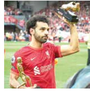
Mohamed Salah Reuters | London

Best still to come from 'legend' Salah after signing new Liverpool deal