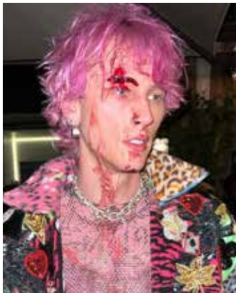
Machine Gun Kelly

"Well, I know you did a sold-out show at MSG last night.