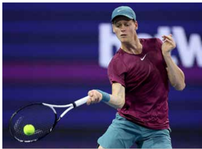
Jannik Sinner of Italy returns a shot to Carlos Alcaraz of Spain

When both players play tennis like this it is very nice to play, you can feel it with the crowds. There was just a great energy with everything. It is just nice to be part of matches like this