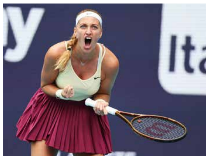
Petra Kvitova of Czechia celebrates a point against Sorana Cirstea of Romania