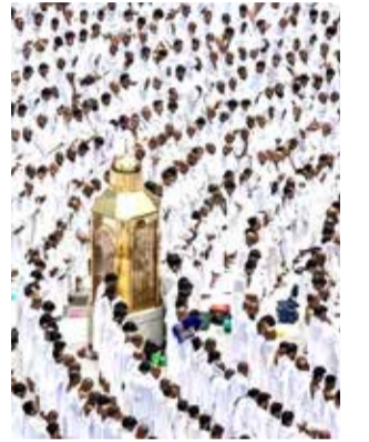
Worshippers stand around Maqam Ibrahim (Station of Abraham) as they pray around the Kaaba