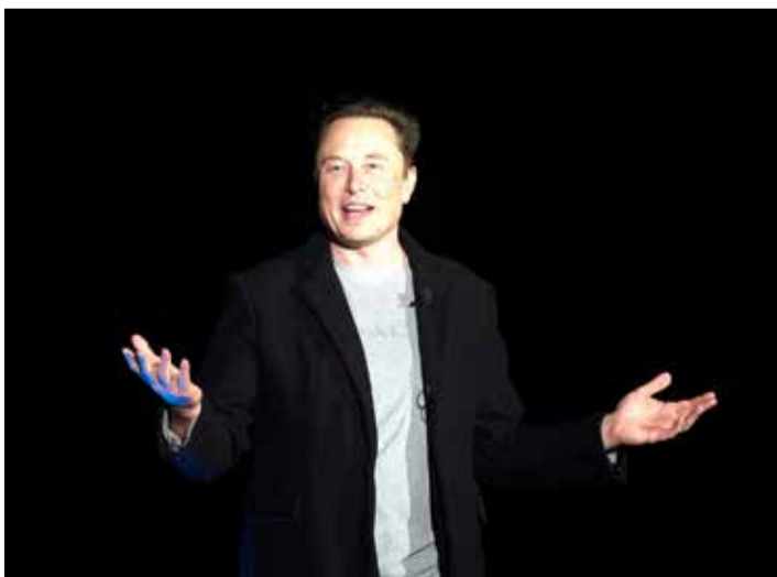
Elon Musk speaks during a press conference at SpaceX's Starbase facility near Boca Chica Village in South Texas

"The fundamental challenge here is that it's (easy) to cre-