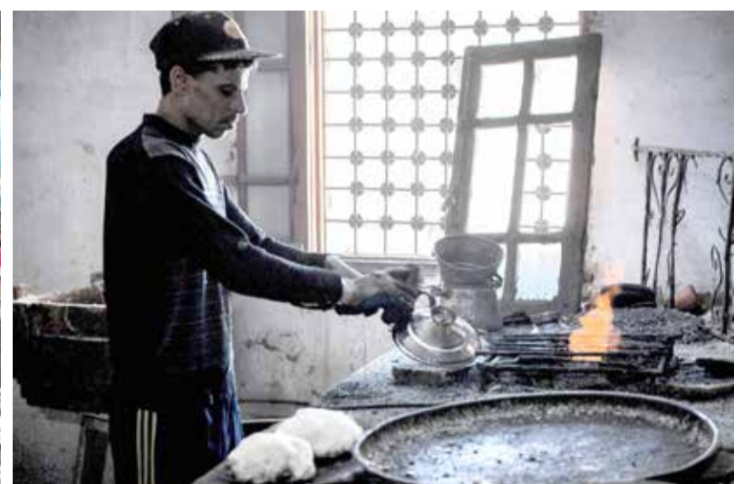
A coppersmith polishes a couscoussier at a workshop in the medina (old city) of Tunis