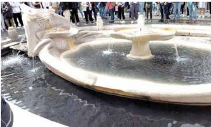
The Barcaccia Fountain at Piazza di Spagna in Rome's historic centre, after the activists poured black liquid

Popular tradition has it he was inspired by the discovery