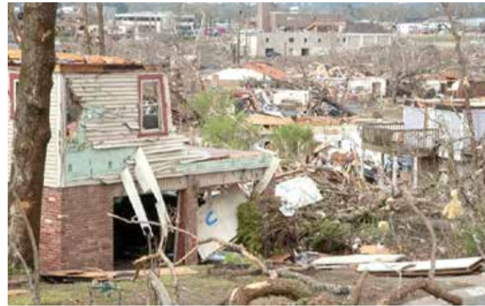
The damaged remains of a neighbourhood is seen in Little Rock, Arkansas

Governor Sarah Huckabee Sanders has declared a state of