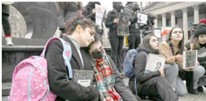
Activists from New York-based Iranian women's rights group Women Life Freedom attend a rally condemning the mass poisoning of Iranian female students, in New York

Authorities later issued an arrest warrant against the man