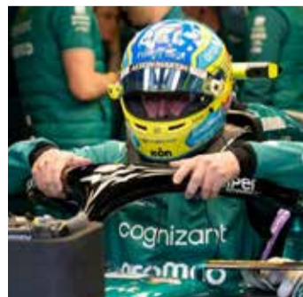
Aston Martin's Fernando Alonso hops in his car ahead of qualifying

He also finished behind revived Mercedes pair George Russell and Lewis Hamilton, but it was a tight finish and the