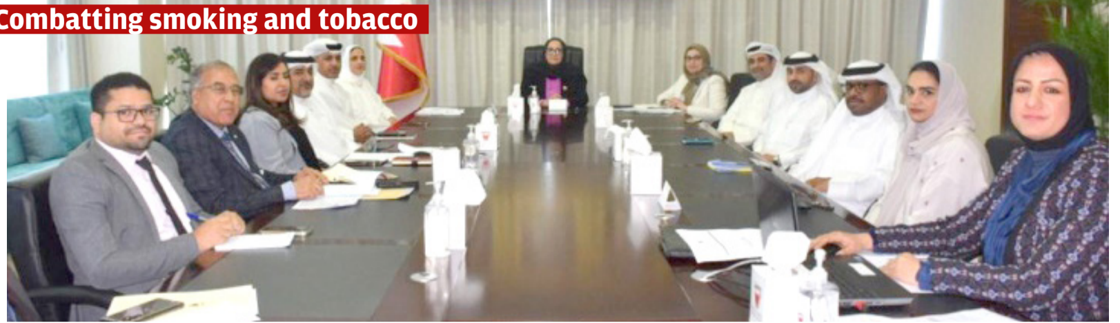
Jalila bint Al-Sayed Jawad Hassan, the Minister of Health, yesterday stressed commitment to developing strategies to combat smoking and tobacco in the Kingdom. This came as she chaired a meeting of the National Committee to Combat Smoking and All Types and Products of Tobacco, which included representatives from various ministries and official authorities. The meeting addressed key issues on the committee's agenda and approved minutes from the previous session.