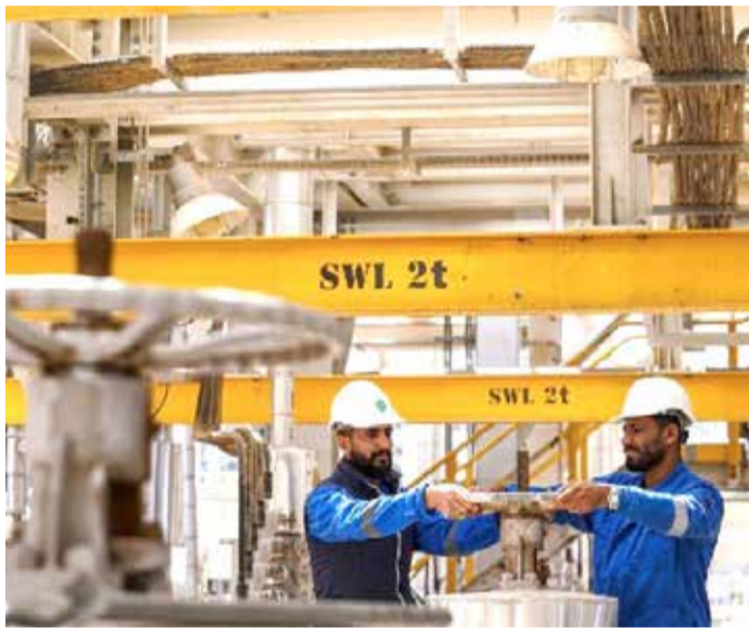
Representative picture

● The refinery also has the capacity to produce 200 megawatts of electricity