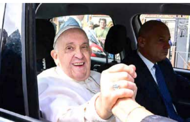
Pope Francis leaves the Gemelli hospital