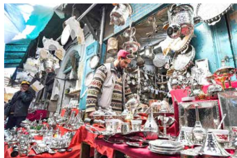
A man views freshly-polished cookware at a coppersmith's workshop in Tunis