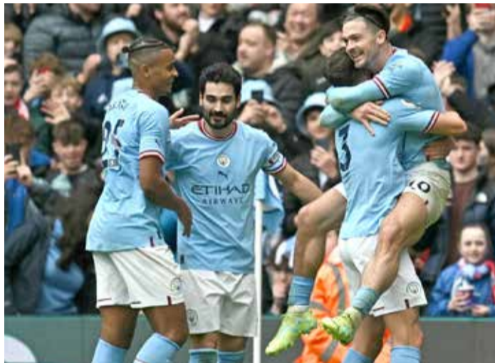
Manchester City's English midfielder Jack Grealish (R) celebrates with teammates after scoring their fourth goal

"Now it's the Jack we thought. Aston Villa fans know this Jack," said Guardiola of Grealish, who joined for a Premier League re-