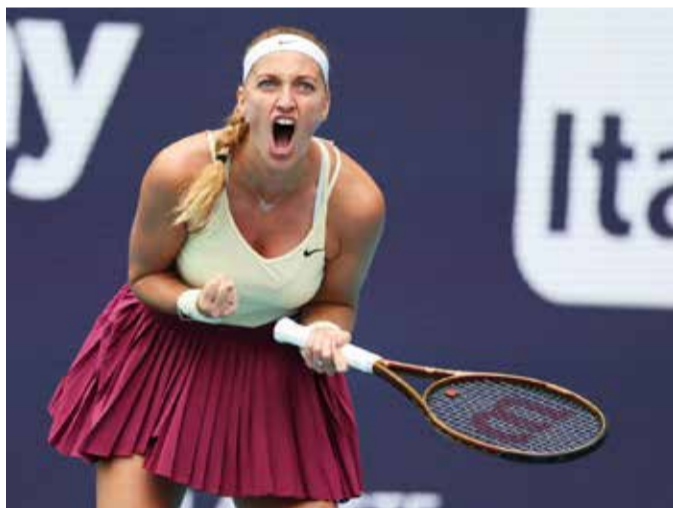
Petra Kvitova of Czechia celebrates a point against Sorana Cirstea of Romania