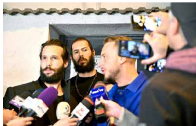
Andrew Tate (C) and his brother Tristan Tate (L) walk out of the central arrest centre of Bucharest police

Tate, a British-American former kickboxer with millions