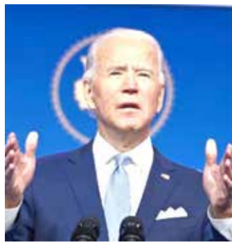
US President Joe Biden