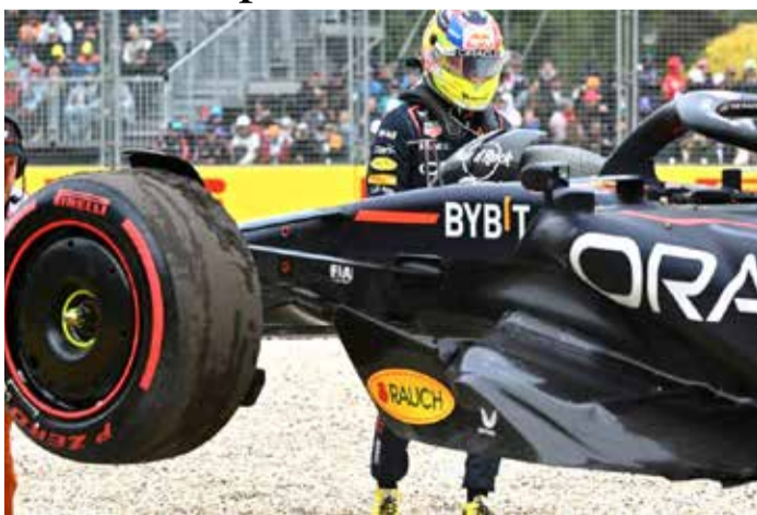
Red Bull Racing's Mexican driver Sergio Perez looks on as marshals remove his car from the side of the track

The problem persisted in qualifying when he locked up and careened into the gravel at Turn 3 on his first lap, beaching the car that had to be removed