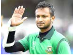
Shakib Al Hasan | Dhaka

Bangladesh have included all-rounder Shakib Al Hasan and batsman Liton Das in the squad for their one-off Test against Ireland, ignoring their requests to join the Indian Premier League.