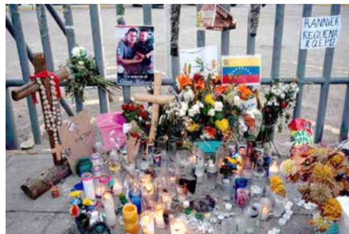
An altar is seen outside the immigration detention center where 39 migrants died during a fire in Ciudad Juarez, Chihuahua state, Mexico

grant accused of starting the fire in a cell where he was being held with 67 other men, apparently in a protest against deportations.