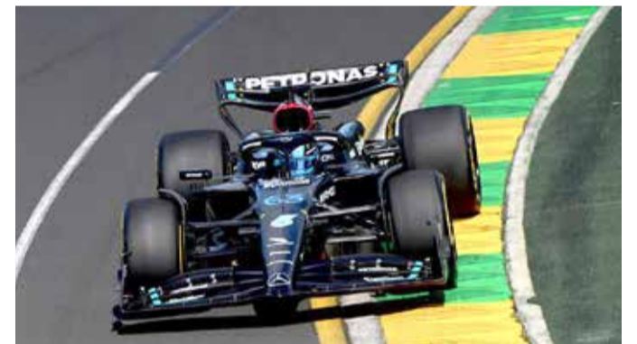
Mercedes' British driver George Russell in action at the Albert Park Circuit