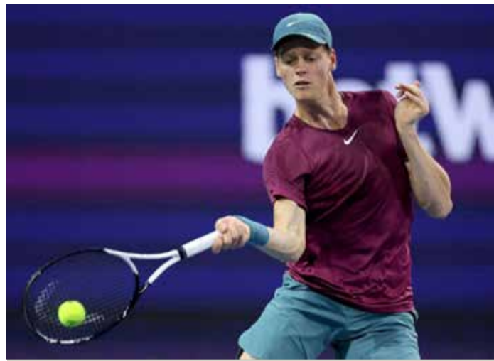
Jannik Sinner of Italy returns a shot to Carlos Alcaraz of Spain

When both players play tennis like this it is very nice to play, you can feel it with the crowds. There was just a great energy with everything. It is just nice to be part of matches like this