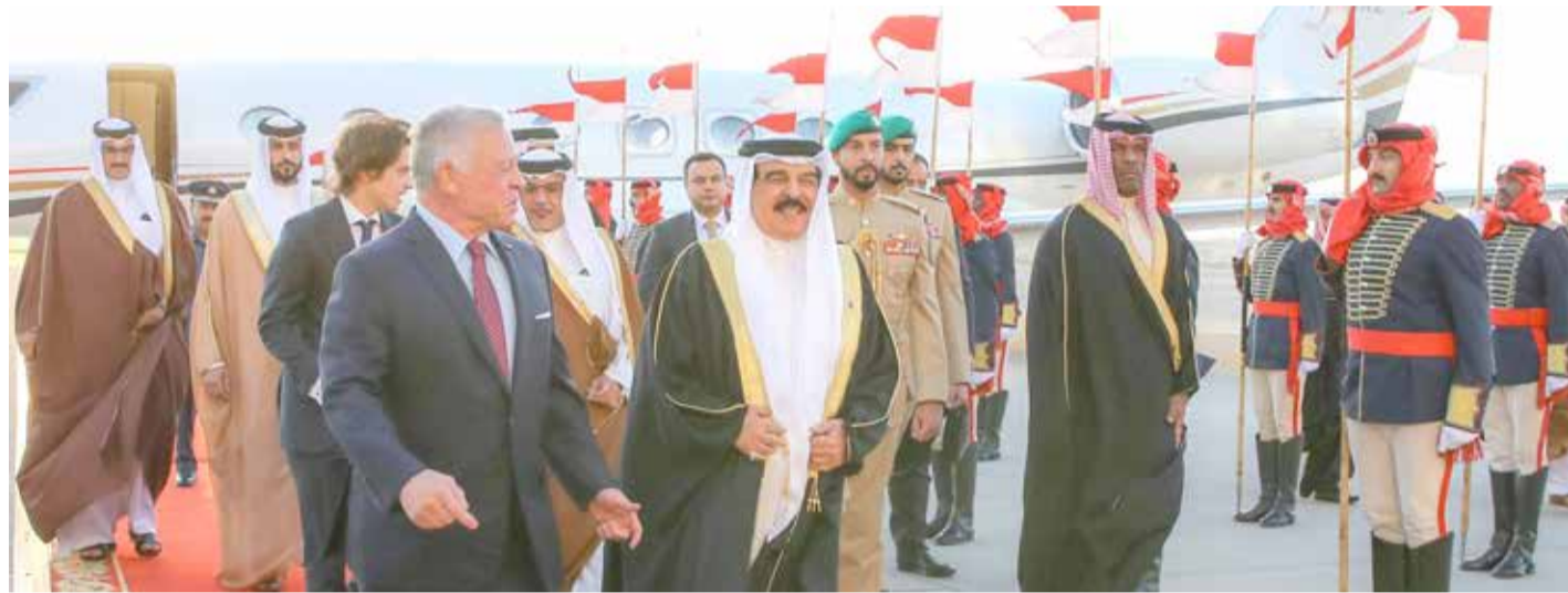
His Majesty King Hamad bin Isa Al Khalifa receives Jordan King Abdullah II bin Al Hussein upon his arrival in the Kingdom yesterday

Bahrain, Jordan leaders support all efforts to resolve regional conflicts