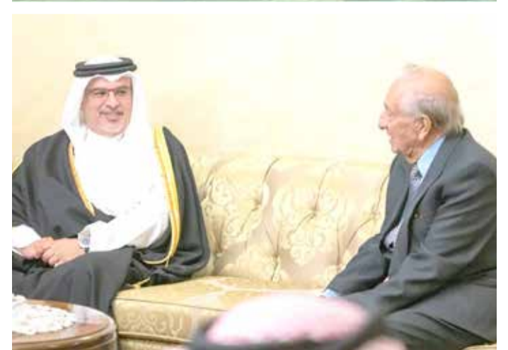
HRH CP, PM during Majlis visits yesterday

across the Kingdom. The Chairman of the Board of Trustees of the Isa bin Salman Charity Educational Charitable Trust, His Highness Shaikh Isa bin Salman bin Hamad Al Khalifa, the Minister of Finance and National Economy, HE Shaikh Salman bin Khalifa Al Khalifa, and several senior officials accompanied His Royal Highness the Crown Prince and Prime Minister during the majlis visits.