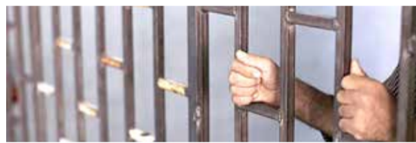
Representative picture of Asian national while he was walking in the neighbourhood.

The suspects, police said, who are both Asian nationals, are accused of forcefully stealing from a fellow