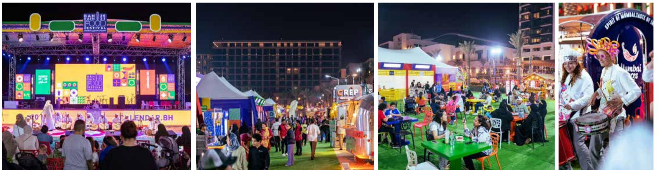
In picture, the food festival organised by BTEA