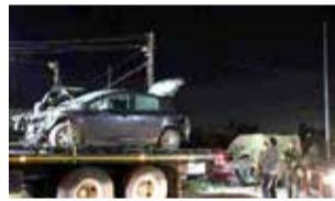
A damaged vehicle is loaded on a flatbed truck at the site of a ramming attack near the town of Beit Ummar, north of Hebron city