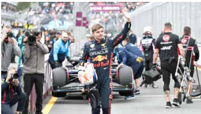
Red Bull Racing's Dutch driver Max Verstappen reacts after taking pole position

Alpine's Pierre Gasly was ninth with Nico Hulkenberg in