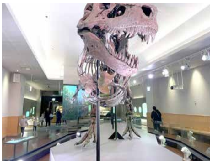
The skeleton of "Sue" the Tyrannosaurus rex at the Field Museum of Natural History in Chicago