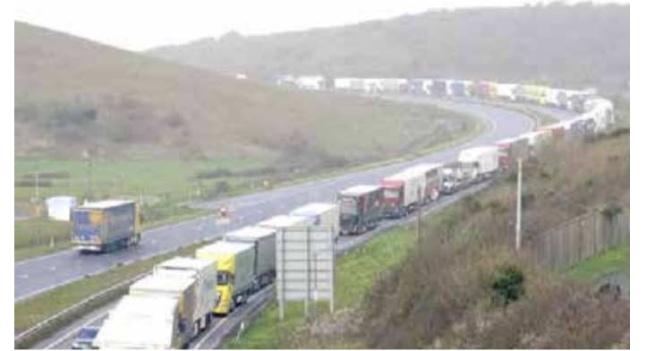
Lorries queue on the A20 to get to the Port of Dover in Kent, England

Dover Port on Saturday coaches said were now waiting "several hours but tourist cars are getting through OK".