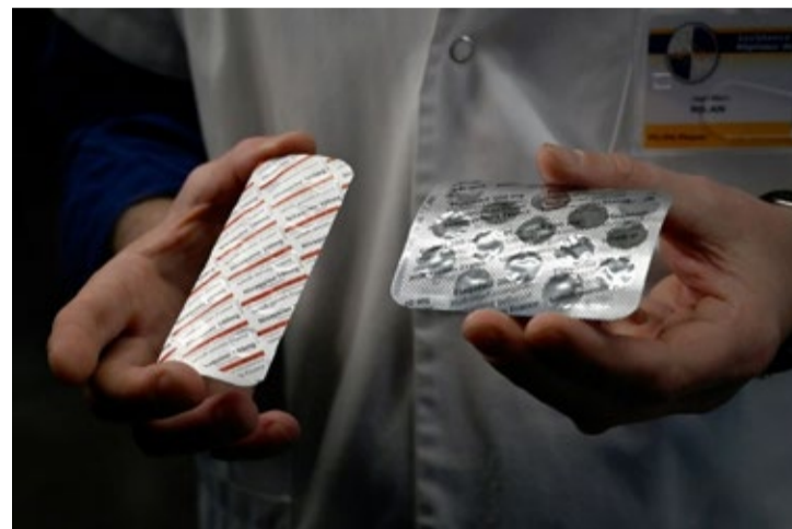
Around the world, countries are expanding access to the two compounds, which are used to treat malaria and are known to have anti-viral properties

Both drugs have a number of potentially serious side effects, especially when taken in high