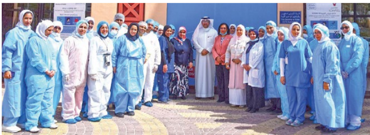
The Health Minister and other officials during their field visit to BIECC

Nurses have their clear imprints in the development and