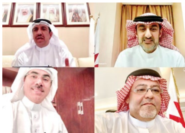
A screenshot of the video conference

Al Buainain praised the continuous support of the Government Executive Committee, chaired by His Royal Highness Prince Salman bin Hamad Al Khalifa, Crown Prince, Deputy Supreme Commander and First Deputy Prime Minister, who had a prominent role in the success of these efforts and achievements. All this comes in line with the comprehensive development