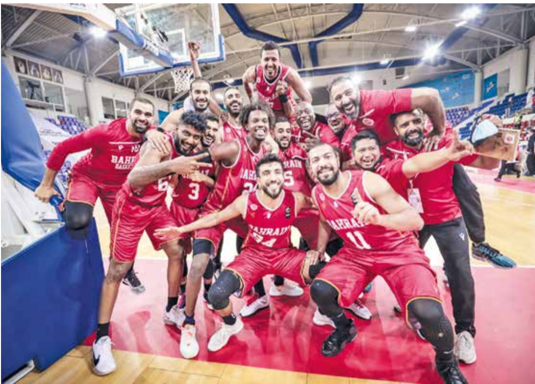
Bahrain national team members celebrate after their win over India on Sunday, securing their qualification for the FIBA Asia Cup 2021

Bahrain will be one of 80 countries from around the world competing for 32 spots in basketball's showcase tournament, which will be jointly hosted by Indonesia, Japan and the Phil-