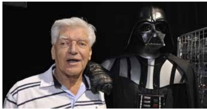
David Prowse poses with a fan dressed up in a Darth Vader costume