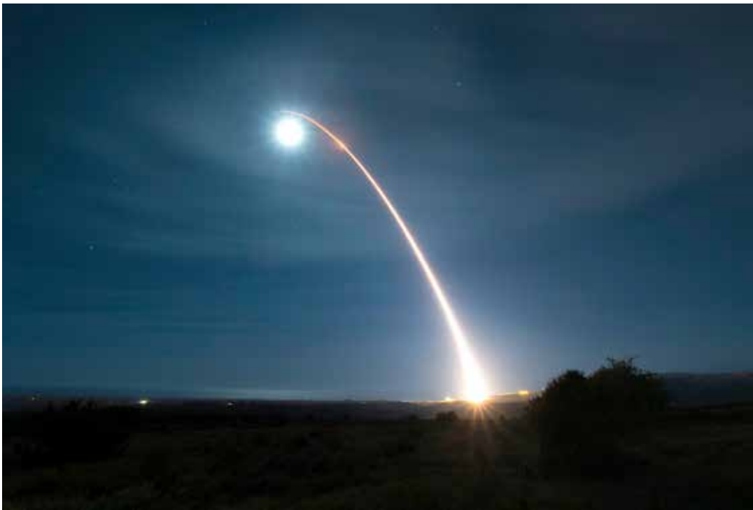
This handout from the US Air Force shows an unarmed Minuteman III intercontinental ballistic missile launching during a developmental test

"A nuclear-armed bully is resuming testing of atomic weapons. The same bully has been