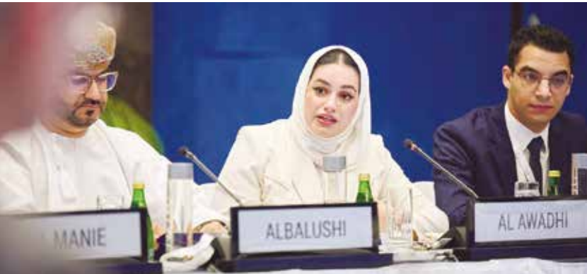
IISS Manama Dialogue Middle East and North Africa Young Leaders' Programme

By nurturing this community of future policymakers and strategic thinkers, the IISS aims to empower the next generation to shape the course of governance, diplomacy, and economic development across the Middle East and beyond.