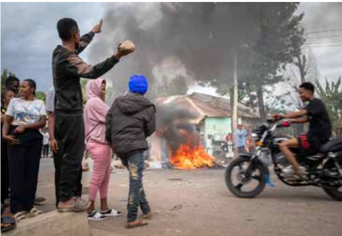
People protest in the streets of Arusha, Tanzania

But the vote descended into chaos as crowds took to the streets of Dar es Salaam and other cities, tearing down her