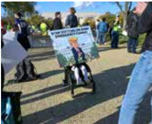
People attend the People's Pantry Food drive to replenish food banks ahead of SNAP lapse at the USDA Headquarters, in the National Mall, Washington AFP | Washington

The US government shutdown barreled towards its second month yesterday and the pain is spreading fast -- with federal workers broke, food aid vanishing and millions of Americans caught in the crossfire.