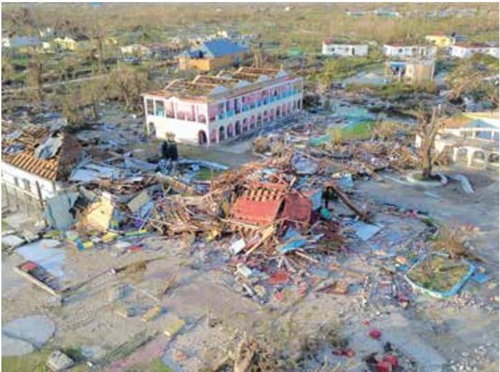
An aerial view of destroyed buildings following the passage of Hurricane Melissa, in Black River, St. Elizabeth, Jamaica

Hurricane Melissa was “moving quickly away” from Bermuda early yesterday after the death toll rose to nearly 50 people, officials said. The ferocious storm has devastated Caribbean islands and is expected to become an “extratropical cyclone” later in the day, reaching the northeastern United States and eastern Canada, the National Hurricane Center (NHC) said in its latest advisory. “After Melissa becomes post-tropical, a brief period of heavy rain and gusty winds is possible over the southern Avalon Peninsula of Newfoundland tonight,” the NHC added. Flooding was expected to subside in the Bahamas although high water could persist in Cuba, Jamaica, Haiti and neighboring Dominican Republic, the agency said. The storm, one of the most powerful ever recorded, was made four times more likely because of human-caused climate change, according to a study by Imperial College London. Melissa smashed into both Jamaica and Cuba with enormous force, and residents were assessing their losses and the long road to recovery. In Jamaica, “the confirmed