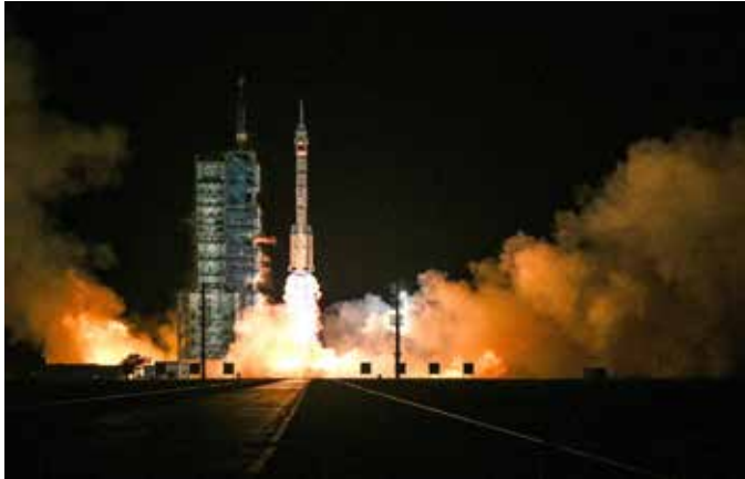
A Long March-2F carrier rocket, carrying the Shenzhou-21 spacecraft and a crew of three astronauts, lifts off from the Jiuquan Satellite Launch Centre