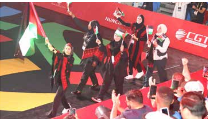
The Palestinian delegation parades to a warm and enthusiastic reception from the crowd

stage such a major continental event with grace, efficiency, and heart, highlighting the volunteers and young athletes as the true heartbeat of the Games. His remarks drew warm applause when he thanked His Majesty King Hamad bin Isa Al Khalifa, whose patronage, he said, gave the Games their soul.