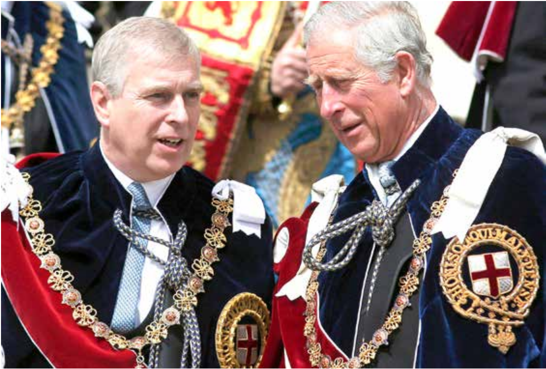
Britain’s Prince Andrew, Duke of York (L) and Britain’s Prince Charles, Prince of Wales attend the Most Noble Order of the Garter Ceremony at Windsor Castle in southern England, on June 15, 2015

King Charles III is stripping his younger brother Andrew of his royal titles and ousting him from his long-term residence on the Windsor estate, the palace said on Thursday, the latest fallout to hit the scandal-plagued royal over the Jeffrey Epstein affair. “Prince Andrew will now be known as Andrew Mountbatten Windsor,” Buckingham Palace said, adding Charles had begun the formal process to remove all his brother’s titles. Andrew has also been told to move out of his long-time home on Windsor Castle’s sprawling grounds, and he will move “to alternative private accommodation” as soon as possible. The announcement followed a torrent of outrage at renewed accusations of sexual assault made by one of Jeffrey Epstein’s main accusers against the 65-year-old, who has denied the charges. “These censures are deemed necessary, notwithstanding the fact that he continues to deny the allegations against him,” the palace said. “Their Majesties wish to make clear that their thoughts and utmost sympathies have been, and