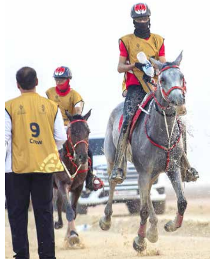
Team Bahrain in action during the Games' final event, equestrian sports, securing a proud silver finish

As the evening drew to a close, the atmosphere inside Khalifa Sports City was one of pride and reflection. Bahrain's eight-month journey, from planning to podiums, had come full circle, leaving behind a legacy of friendship, excellence, and belief in what youth can achieve.