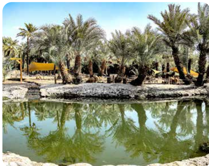
A view of a spring at the Khaybar Volcano Camp centre in the old town of the Khaybar oasis in northwestern Saudi Arabia

The large town, which was home to up to 500 residents, was built around 2,400 BC during the early Bronze Age, the researchers said.