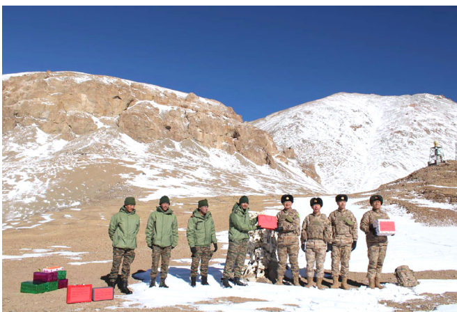
Indian and Chinese army greet each other along the Line of Actual Control (LAC) near Karakoram pass in Ladakh | New Delhi, India

Indian and Chinese troops exchanged boxes of sweets on Thursday at two points on their contested high-altitude border, a week after the leaders of the Asian rivals held a rare meeting.