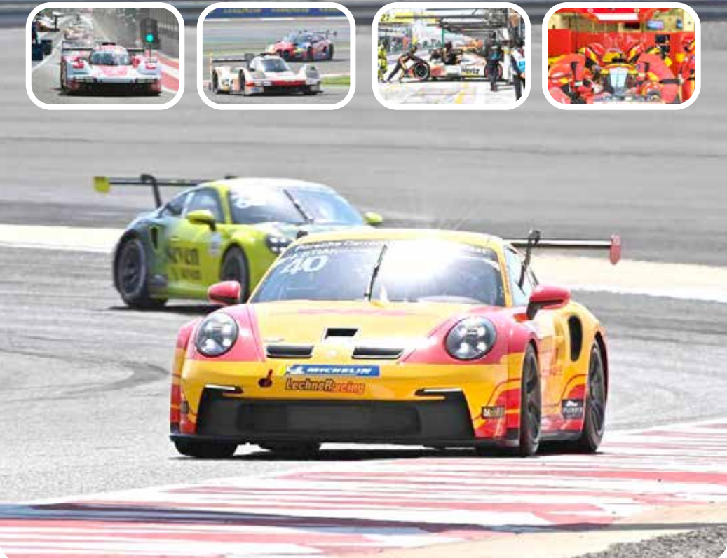
The Bahrain International Circuit, "the home of motorsports in the Middle East," opens its doors to the public today for the Bahrain 8-Hour Endurance Race, sponsored by Bapco Energies. This event is part of the World Endurance Championship and will continue until Saturday. The circuit calls on fans to join and enjoy the thrilling finale packed with international races and entertainment events. The doors will open from 10:30 AM to 6:30 PM, while on race day, Saturday, the doors will open from 10:30 AM to 10 PM.