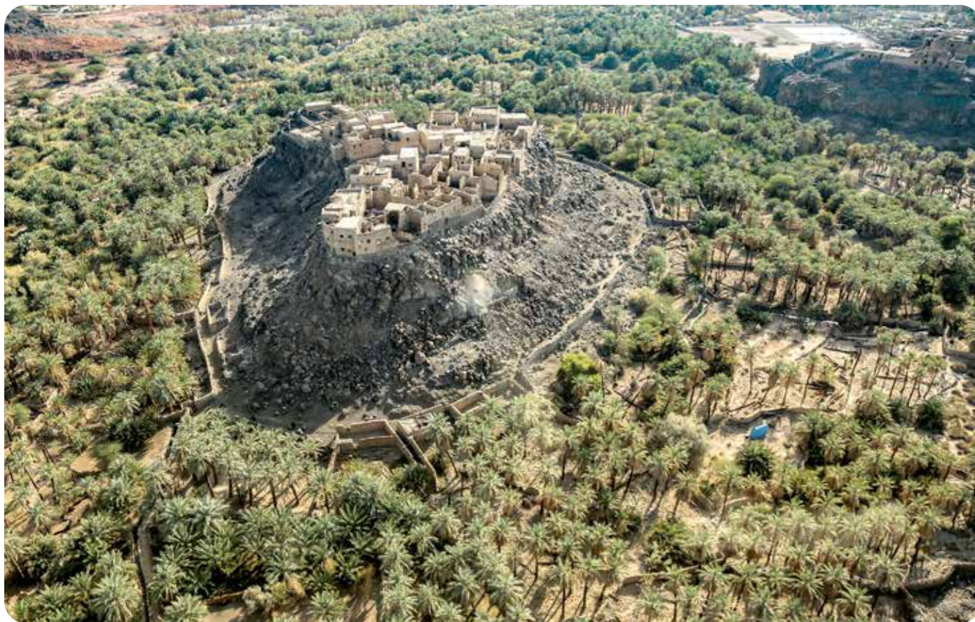
an aerial view of an old fort in the Khaybar oasis in northwestern Saudi Arabia.

The large town, which was home to up to 500 residents, was built around 2,400 BC during the early Bronze Age. It was abandoned around a thousand years later.