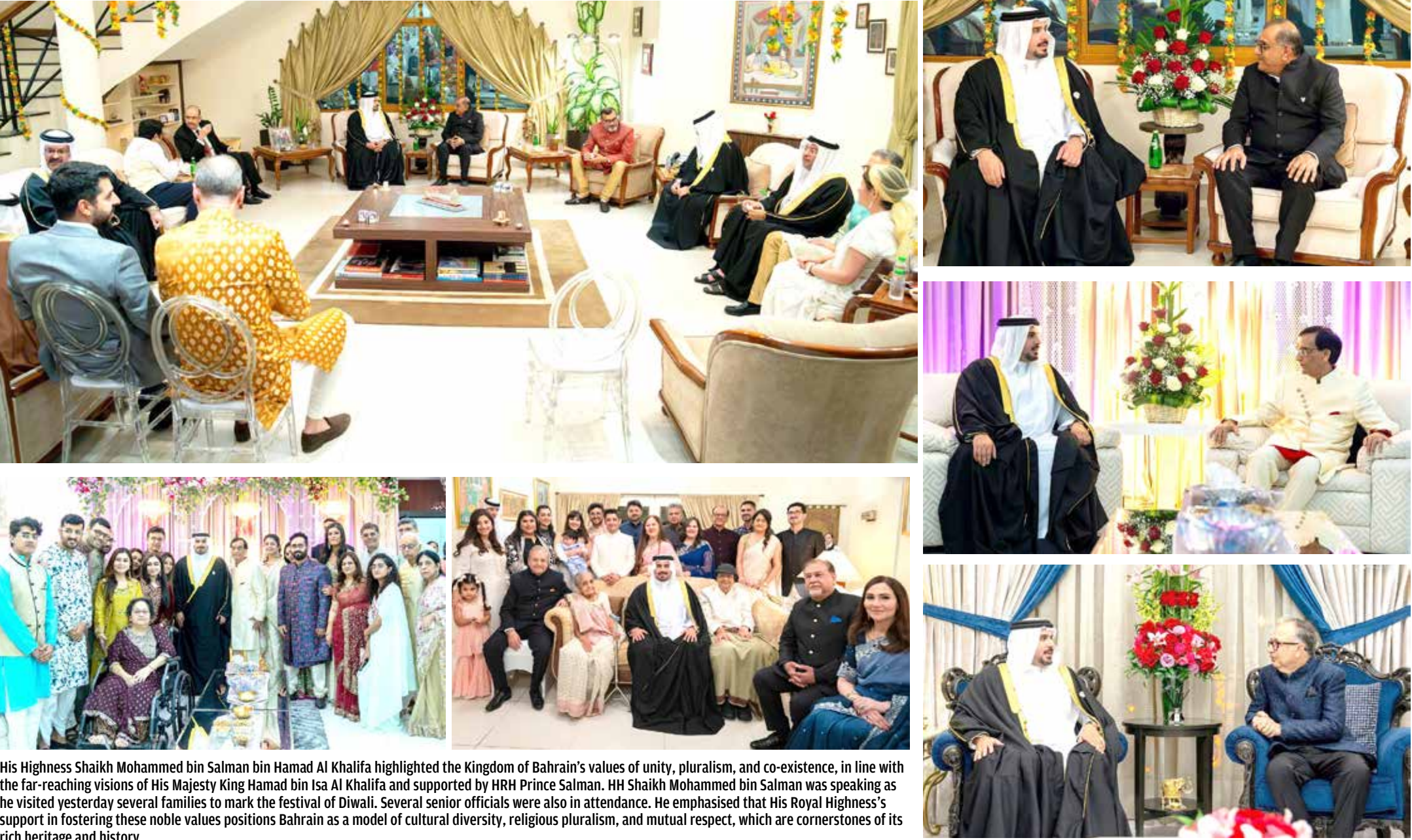
His Highness Shaikh Mohammed bin Salman bin Hamad Al Khalifa highlighted the Kingdom of Bahrain's values of unity, pluralism, and co-existence, in line with the far-reaching visions of His Majesty King Hamad bin Isa Al Khalifa and supported by HRH Prince Salman. HH Shaikh Mohammed bin Salman was speaking as he visited yesterday several families to mark the festival of Diwali. Several senior officials were also in attendance. He emphasised that His Royal Highness's support in fostering these noble values positions Bahrain as a model of cultural diversity, religious pluralism, and mutual respect, which are cornerstones of its rich heritage and history.