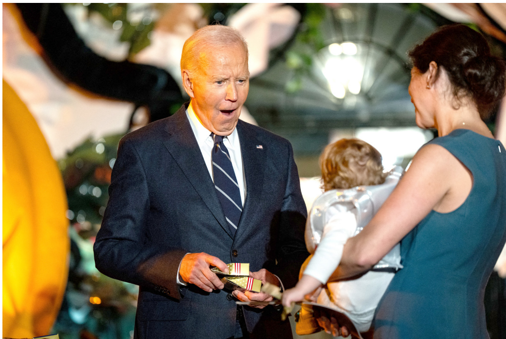
US President Joe Biden reacts as he greets a trick-or-treater during a Halloween event at the White House on October 30, 2024 in Washington, DC. The President and first lady are hosting children from local neighborhoods, public schools and military families for the annual trick-or-treating event.

"When you have an efficient organization with great people up and down the line, counties are doing good work, then those are results you can trust," he said. "And I think trust is the new gold standard."