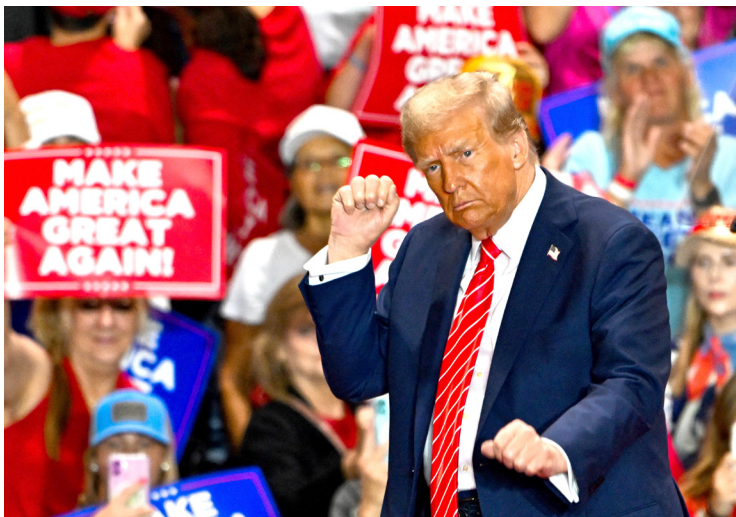
Former US President and Republican presidential candidate Donald Trump dances as he leaves a campaign rally in Rocky Mount, North Carolina

New Mexico on Thursday, and Virginia on Saturday -- surprising calls given that polls suggest the two states will go to Harris.