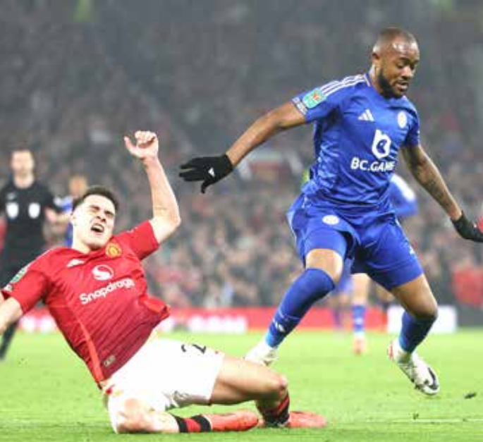
Manchester United's Uruguayan midfielder #25 Manuel Ugarte (L) vies with Leicester City's French-born Ghanaian striker #18 Jordan Ayew (R) during the English League Cup round of 16 football match between Manchester United and Leicester City at Old Trafford in Manchester, north west England

United's reward is a trip to Tottenham in the last eight after they eliminated a City side