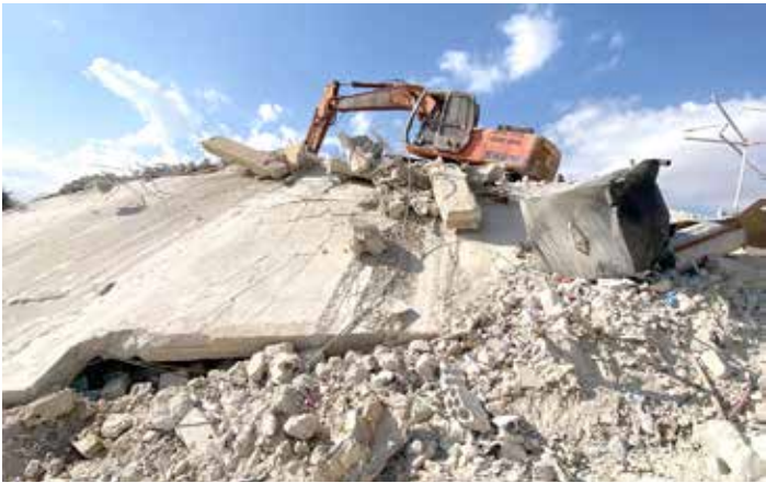
Workers remove the rubble from the site of an Israeli airstrike the previous day that targeted the eastern Lebanese village of Bednayel in the Bekaa valley

Gaza, Lebanon and Sudan will take decades to recover from the conflicts raging on their soil, the International Monetary Fund said on Thursday after downgrading the region's growth forecast. Israel's military actions against Hamas in the Gaza Strip