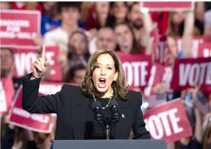
US Vice President and Democratic presidential candidate Kamala Harris speaks during a "When We Vote We Win" campaign rally at the Veterans Memorial Coliseum at Alliant Energy Center in Madison, Wisconsin

defensive after Biden appeared to call Trump supporters "garbage"