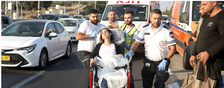
First responders transport a woman to an ambulance following a rocket attack from Lebanon near Kiryat Ata in northern Israel's Haifa district

The strikes on Al-Hawsh coincided with an exodus of civilians from the Rashidieh camp for Palestinian refugees near Tyre which was also covered by the evacuation warning, the official National