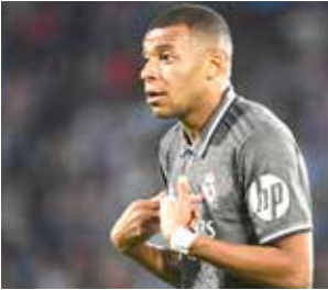
Real Madrid's French forward #09 Kylian Mbappe

The tourists won the first Test by seven wickets.