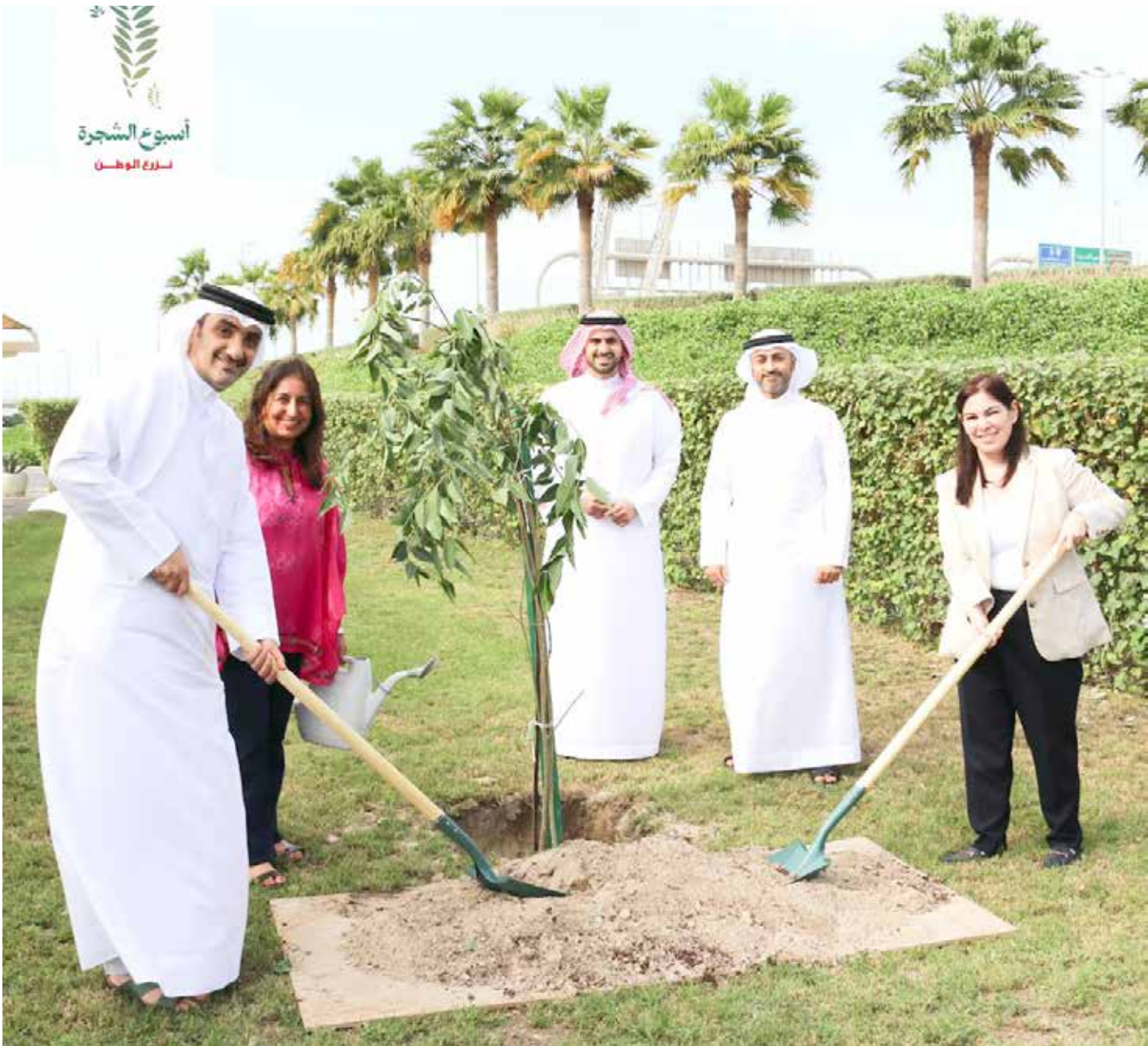
In line with His Majesty King Hamad bin Isa Al Khalifa's National Action Plan to achieve carbon neutrality and the recent launch by His Royal Highness Prince Salman bin Hamad Al Khalifa, the Crown Prince and Prime Minister, of the National Tree Week initiative, Shaikh Abdullah bin Khalifa Al Khalifa, CEO of Mumtalakat, participated in a tree-planting ceremony at the company's headquarters. The National Tree Week initiative supports the Kingdom's afforestation plan, which aims to double the number of trees to 3.6 million by 2035, contributing to Bahrain's commitments under the United Nations Framework Convention on Climate Change (UNFCCC).

Supports Bahrain's National Tree Week Initiative