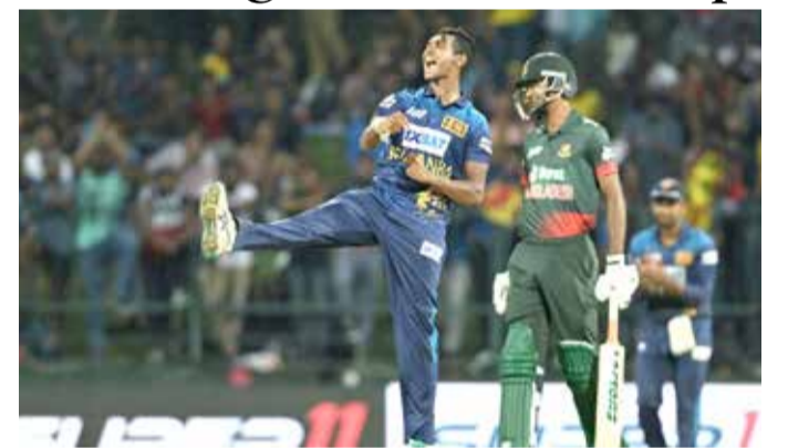
Sri Lanka's Matheesha Pathirana (L) celebrates after taking a wicket