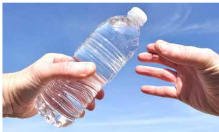
Offering cold drinks to delivery people is a kind gesture

Other netizens joined in the discussion as they, too, are frequently requested by delivery drivers for a cool drink during