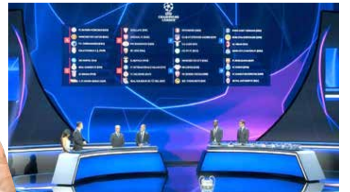
A screen displaying the fixtures for the group stage of the UEFA Champions League football cup is seen after the draw