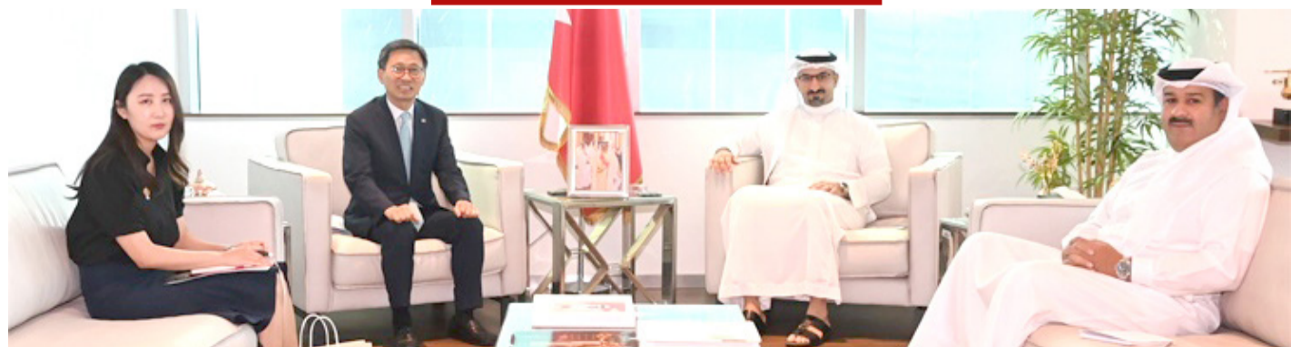
Industry and Commerce Minister Abdullah bin Adel Fakhro received the newly appointed South Korean Ambassador to Bahrain, Heon Sang Koo. The meeting reviewed bilateral relations, and ways of cooperation in various fields, especially in the industrial and trade fields. Fakhro pointed out to the role that the private sector can play in both friendly countries, which can contribute significantly to achieving common goals. The minister wished the new ambassador success in performing his diplomatic duties, stressing the importance of continuing to develop bilateral ties and boost them to broader horizons.