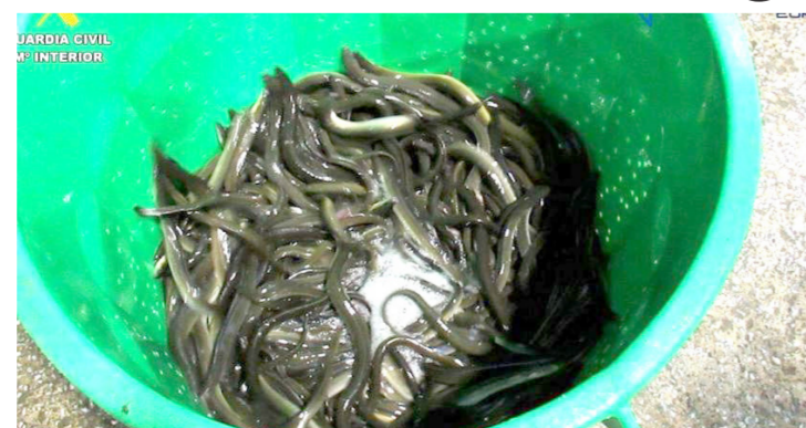
Representative picture smashed three separate organised crime groups involved in the trade of the creatures with the arrest of 30 people, the statement added.

Police across Europe have seized 25 tonnes of eels and baby eels destined for Asia in a huge operation targeting smugglers of the critically endangered creatures, Spanish police said yesterday. Officers arrested 256 suspected smugglers as part of the "historic" operation coordinated by the European Union's police agency Europol that involved 32 European countries including France and Portugal, Spain's Guardia Civil police force said in a statement. The bulk of the eels, 18 tonnes, were seized in Spain where police