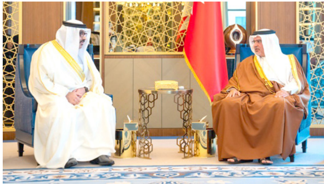
HRH the Deputy King meets with the Education Minister

by wishing students, academic, and administrative bodies from all institutions and educational levels a successful new academic year.