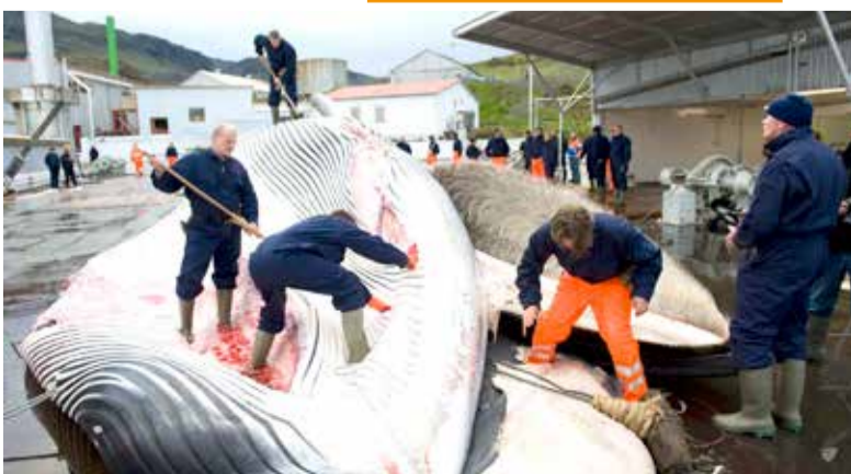
A file photo shows whalers cut open a 35-tonne Fin whale, one of two fin whales caught aboard a Hvalfsjour, north of Reykjavik, on the western coast of Iceland on June 19, 2009. Iceland's government said whaling could resume from today with stricter conditions and monitoring after it decided not to extend a temporary two-month ban imposed amid animal welfare concerns.