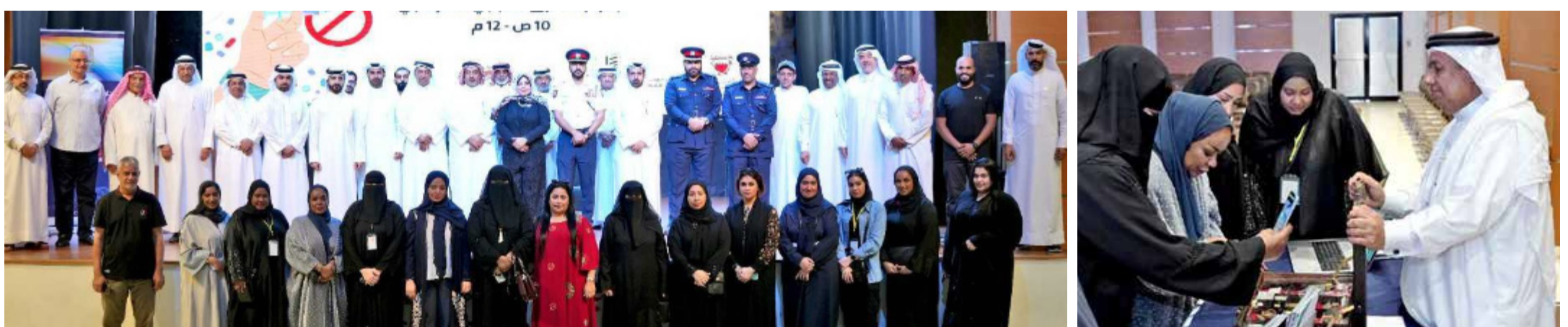
The General Directorate of Criminal Investigation and Forensic Science has participated in an anti-drug awareness campaign for the Good Imprint Association. The participation was part of efforts to promote community partnership and encourage youth to avoid drug addiction.