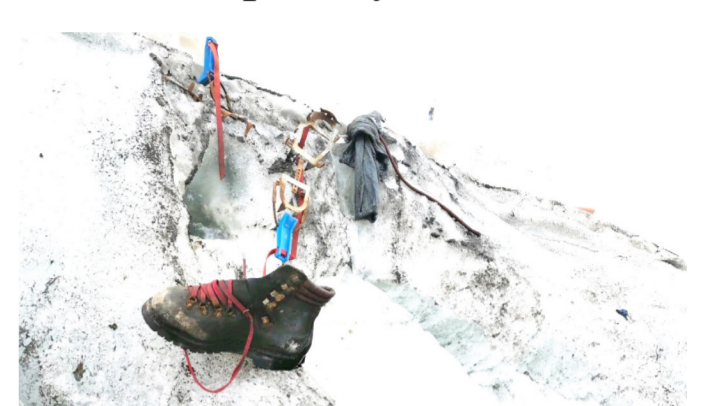
Geneva, Switzerland

The remains of a climber discovered in the Swiss Alps last year have been identified as a British mountaineer who went missing 52 years ago, local police said yesterday. It is the latest in a series of discoveries of remains of long-missing climbers revealed as the Alp's glaciers melt and recede because of global warming. The climber was reported missing in July 1971 but search teams at the time turned up nothing, said police in the canton of Valais, southwest Switzerland. Then on August 22, 2022, two climbers found human remains on the Chessjenglet-scher glacier near Saas-Fee, an Alpine village in the Saas Valley. It took a year to identify the person, as experts worked their way through the case files of missing climbers. Finally, with the help of Interpol Manchester and the police in Scotland, a relative was found and a DNA sample allowed them to identify the British mountaineer, police said in a statement. The climber was formally identified on August 30. Increasing numbers of human remains, some of them of climbers missing for decades, have been discovered in recent years as glaciers in the Alps melt because of global warming.