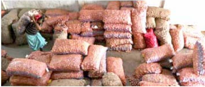
A labourer carries a sack of vegetables at a wholesale market in Hyderabad

Its growth has rebounded since the Covid-19 pandemic -- up 7.2% for the year to March