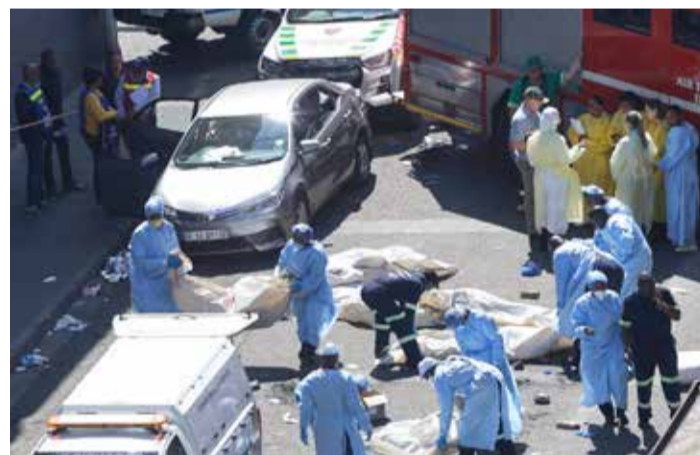
The forensic department members move bodies at the scene of a fire in Johannesburg yesterday.

"We are having 12 children involved also in this tragedy," he told a press conference.