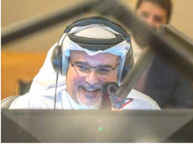
HRH Prince Salman during interview