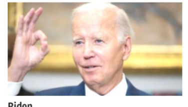
Biden Military Financing programme, which generally involves grants or loans to sovereign countries.

President Joe Biden's administration has for the first time approved direct US military aid to Taiwan under an assistance program aimed at foreign governments, officials said Wednesday, as worries grow over China. The State Department informed Congress on Tuesday of the $80 million package, which is small compared with recent sales to Taiwan but marks the first assistance to Taipei under the Foreign Military Financing programme, which generally involves grants or loans to sovereign countries. The State Department insisted that the first-ever aid under the program did not imply any recognition of Taiwan sovereignty.