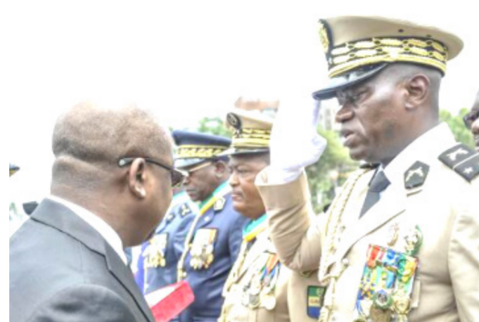
Head of Gabon's elite Republican Guard, General Brice Oligui Nguema (R), is decorated by Gabon Prime Minister Alain Claude Billie Bie Nze (L) in Libreville on August 16, 2023 during celebrations ahead of Gabon Independence day