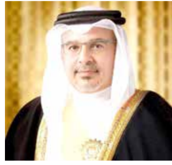
HRH Prince Salman

ness for inaugurating yesterday the main studio of Bahrain TV News Center and the private radio channels building at the Ministry of Information.