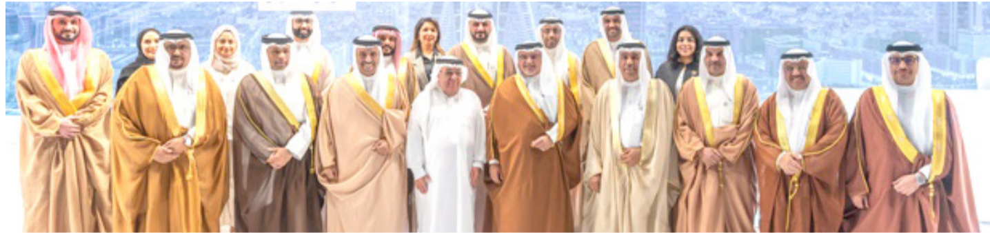
HRH the Deputy King tours the Bahrain TV News Center main studio and private radio channels building

His Royal Highness highlighted the strategic role of the Kingdom's national media in promoting Bahrain's image and its achievements, which were made possible, thanks