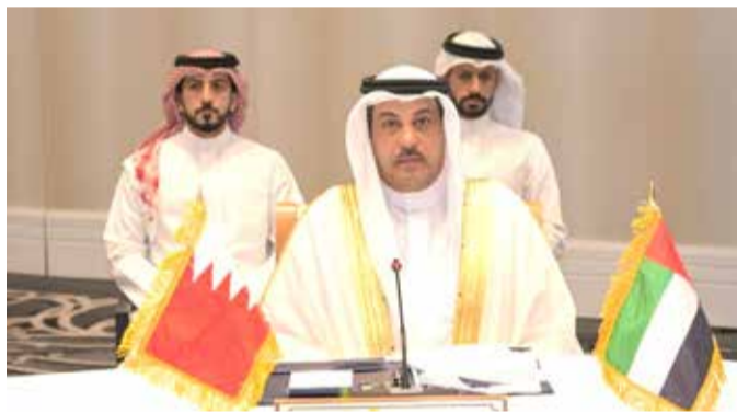
Brigadier Al Kubaisi heads Bahrain's delegation