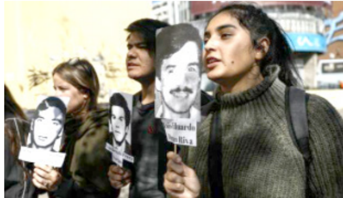
Students of the University of Chile stage a peaceful protest with pictures of missing people to mark International Day of the Victims of Enforced Disappearance, in Santiago

Chile on Wednesday launched the first-ever government project to determine the fate of more than a thousand people who disappeared during the dictatorship of Augusto Pinochet, who grabbed power in a coup 50 years ago. Until now, the burden of searching for the 1,162 people who remain unaccounted for decades after the arrival of democracy, has been borne mainly by bereaved loved ones -- with information on the fate of only 307 -- out of an original 1,469 -- found to date. A major obstacle has been recalcitrance from former soldiers, accused by next-of-kin of having forged a "pact of silence" to keep their crimes hidden.