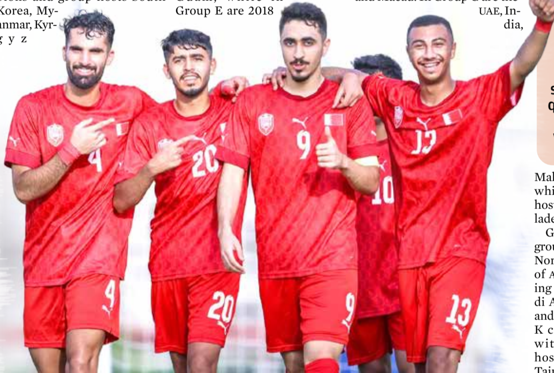
Bahrain Olympic team players during a friendly match in their recent training camp in Bangkok

Group I will see Australia, group hosts Tajikistan, Laos and North Korea; Group J consists of AFC U23 Asian Cup defending champions and hosts Saudi Arabia, Cambodia, Lebanon and Mongolia; and finally Group K comprises just three teams with Turkmenistan, group hosts Indonesia and Chinese Taipei.