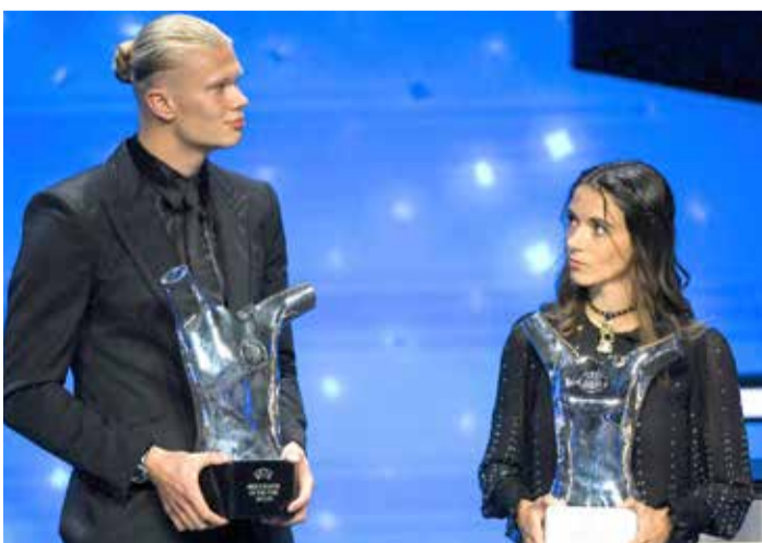
Manchester City's Norwegian striker Erling Haaland (L) and FC Barcelona's Spanish midfielder Aitana Bonmati (R) pose with their season 2022/2023 men's and women's player of the year awards

main last season but has since left to join Inter Miami in Major