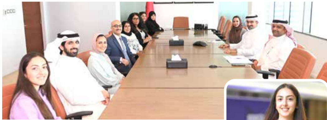
Minister Fakhro meets StartUp Bahrain contest winners

He said the event, now in its fifth edition, serves as a platform for startups to connect with potential investors and