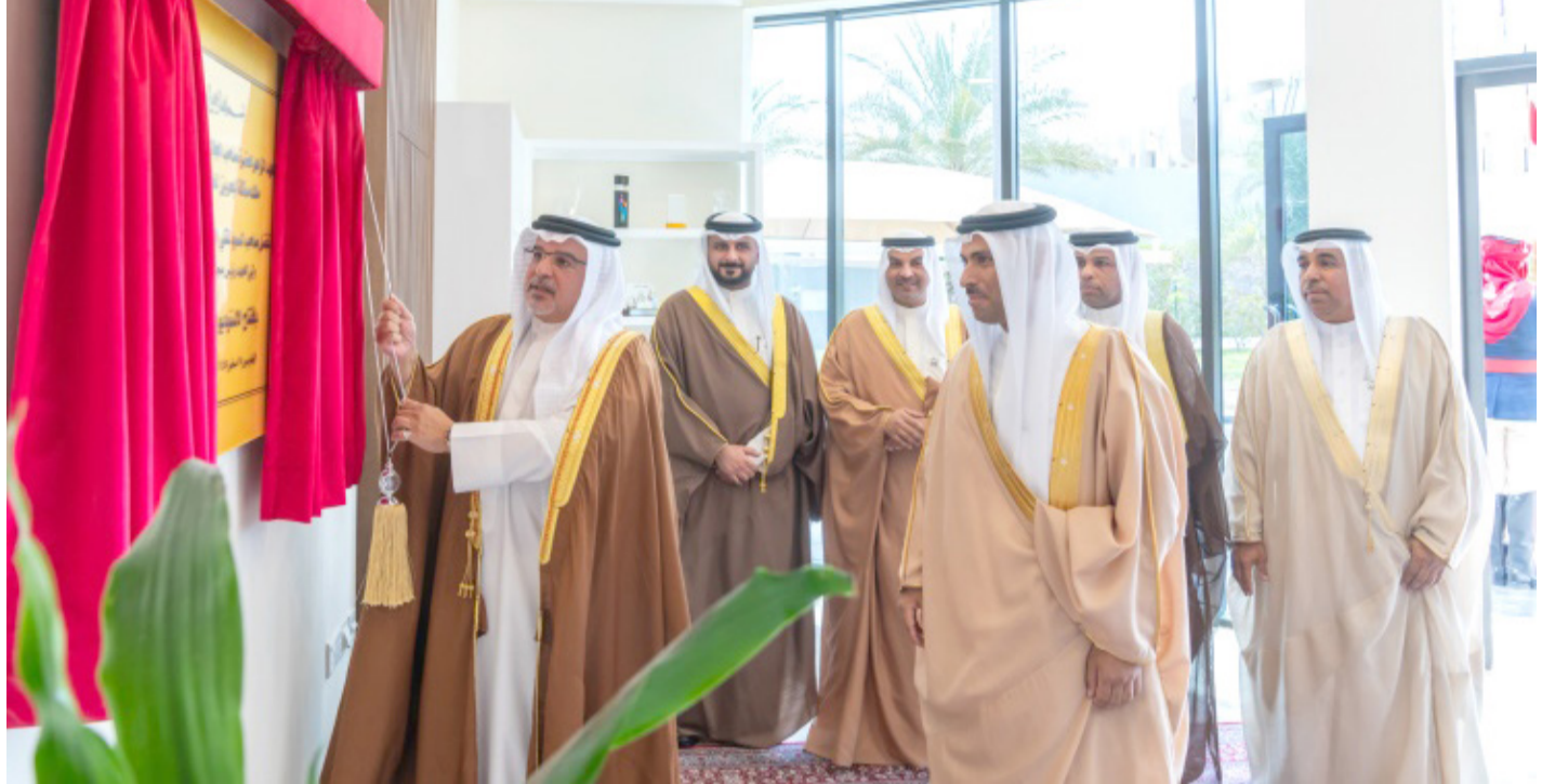
The Deputy King, His Royal Highness Prince Salman bin Hamad Al Khalifa, yesterday inaugurated the main studio of the Bahrain TV News Center and the private radio channels building at the Ministry of Information premises in Isa Town. The inauguration follows the occasion of the 50th anniversary of the establishment of television broadcasting in the Kingdom of Bahrain. (Full report on Page 2)