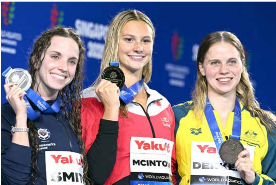
(L-R) Silver medallist US' swimmer Regan Smith, gold medallist Canada's swimmer Summer McIntosh, and bronze medallist Australia's swimmer Elizabeth Dekkers celebrate on the podium of the women's 200m butterfly swimming event during the 2025 World Aquatics Championships in Singapore

"To see that I missed it by that little -- overall really happy with the time and PB (personal best)