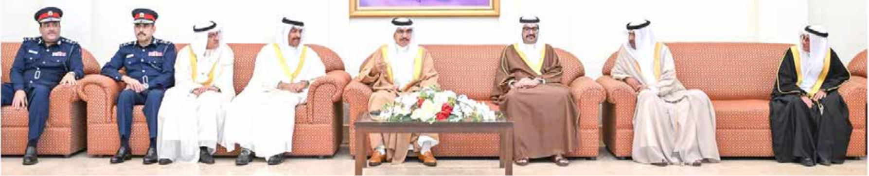
H.E. General Shaikh Rashid bin Abdullah Al Khalifa with Southern Governorate and senior officials from the Ministry of Interior

The visit, attended by His Highness the Southern Governor and senior officials from the Ministry of Interior, comes under the framework of the Bahrainouna national plan, which aims to promote belonging to the nation and reinforce values