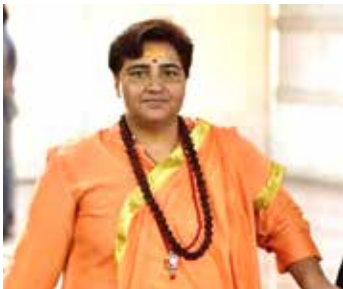
Sadhvi Pragya Thakur,

terrorism and criminal conspiracy charges, including former MP from the ruling Bharatiya