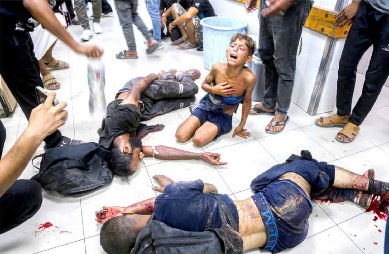
An injured boy reacts as he sits on the ground by other men who were all wounded while previously queueing for aid, at Nasser Medical Complex in Khan Yunis in the southern Gaza Strip

Israeli forces opened fire on a crowd attempting to block an aid convoy