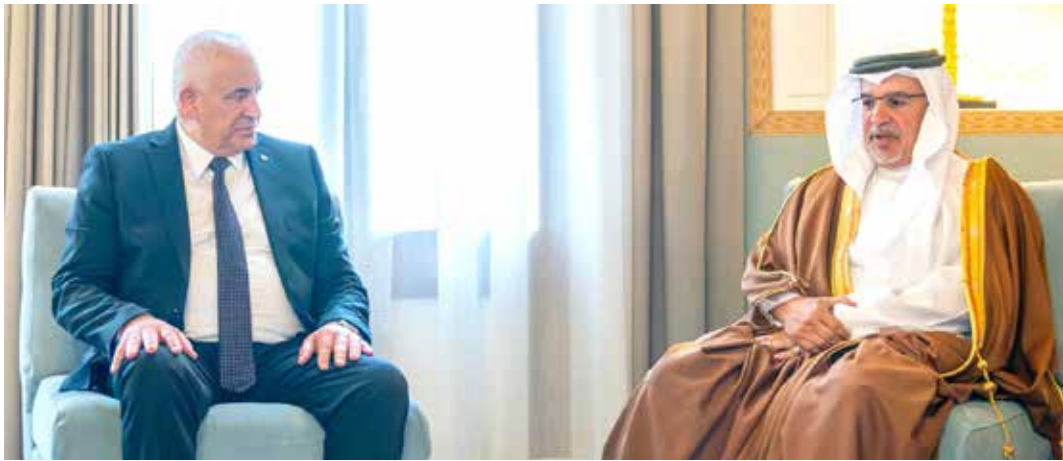
HRH Prince Salman receives H.E. Ziad Mahmoud Hab Al-Reeh and an accompanying delegation

HRH Prince Salman bin Hamad highlighted the longstanding ties between Bahrain and Pales-