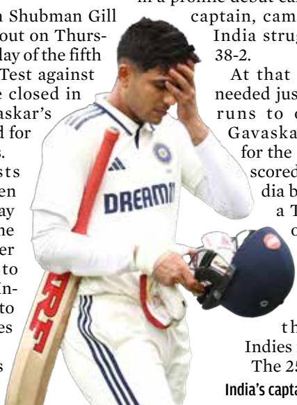
India's captain Shubman Gill leaves the field

already scored four hundreds in a prolific debut campaign as captain, came in with India struggling on 38-2.