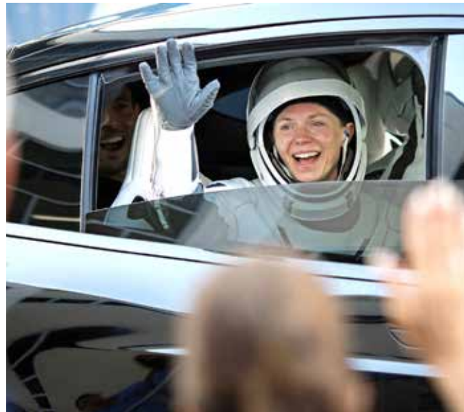
NASA astronaut and mission commander Zena Cardman waves to family members before heading to the launch pad at the Kennedy Space Center in Cape Canaveral, Florida. NASA's SpaceX Crew-11 members are Mission Specialist Kimiya Yui from JAXA (Japan Aerospace Exploration Agency), Commander NASA astronaut Zena Cardman, Mission Specialist Oleg Platonov of Roscosmos and Pilot NASA astronaut Mike Fincke.