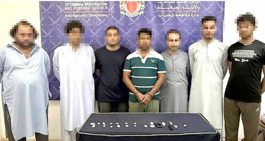
Suspects with the seized evidence

Several individuals of various nationalities, aged between 20 and 49, were arrested in separate cases for attempting to smuggle and possess approximately 14 kilograms of narcotics, with an estimated street value of over BD24,000. Carried out by the Anti-Narcotics Directorate at the General Directorate of Criminal Investigation and Forensic Science, in cooperation with Customs Affairs, the arrest was part of the directorate’s ongoing security efforts to protect society from the scourge of drugs and enforce the law. The directorate explained that upon receiving information about the incidents, investigations and search operations were conducted, leading to the identification and arrest of the suspects, who were found in possession of the narcotics. Legal measures The seized substances were secured, and the necessary legal measures were taken before referring the cases to the Public Prosecution. The Criminal Media Division reaffirmed the continued activation of community partnership through lectures and exhibitions aimed at drug prevention awareness.