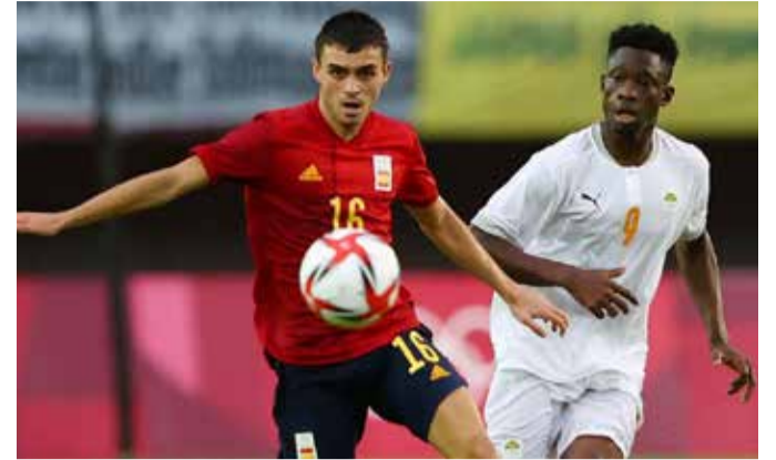
Pedri Gonzalez of Spain in action with Youssouf Dao of Ivory Coast