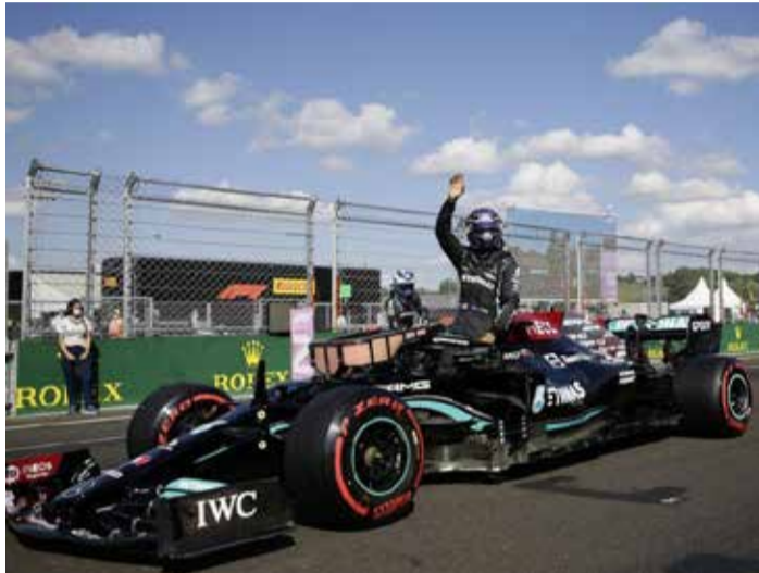
Mercedes' British driver Lewis Hamilton waves from his car as he celebrates winning the pole position

"I was not playing any tactics, I don't need to, I know what I'm doing in the car and am fast