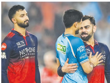
Gujarat Titans' captain Indian cricket player Shubman Gill (C) is congratulated by Royal Challengers Bengaluru's Indian cricket player Virat Kohli (R) after his team's win

Devdutt Padikkal top-scored with a fluent 40, while left-arm pacer Arshad Khan (3/22), Gujarat's most successful bowler, received excellent support from Afghan Rashid Khan.